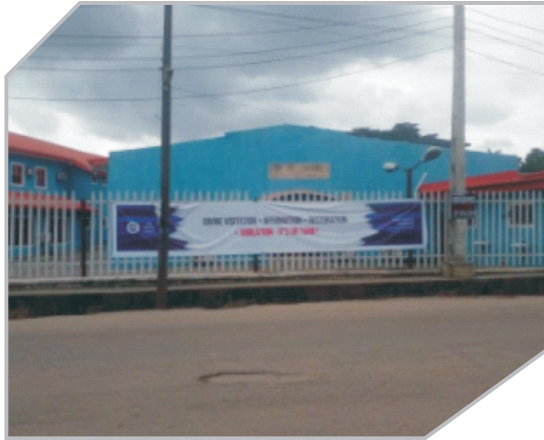
REDEEMED CHRISTIAN CHURCH OF GOD (ROYAL COURT) ALONG ALAKIJA ROAD OPP YABATECH, YABA.