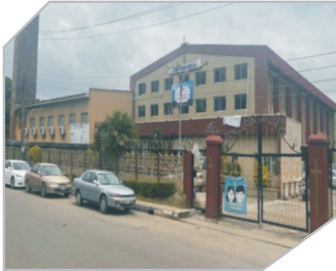
ALL SAINST ANGLICAN CHURCH ALONG MONTEGERY ROAD, YABA