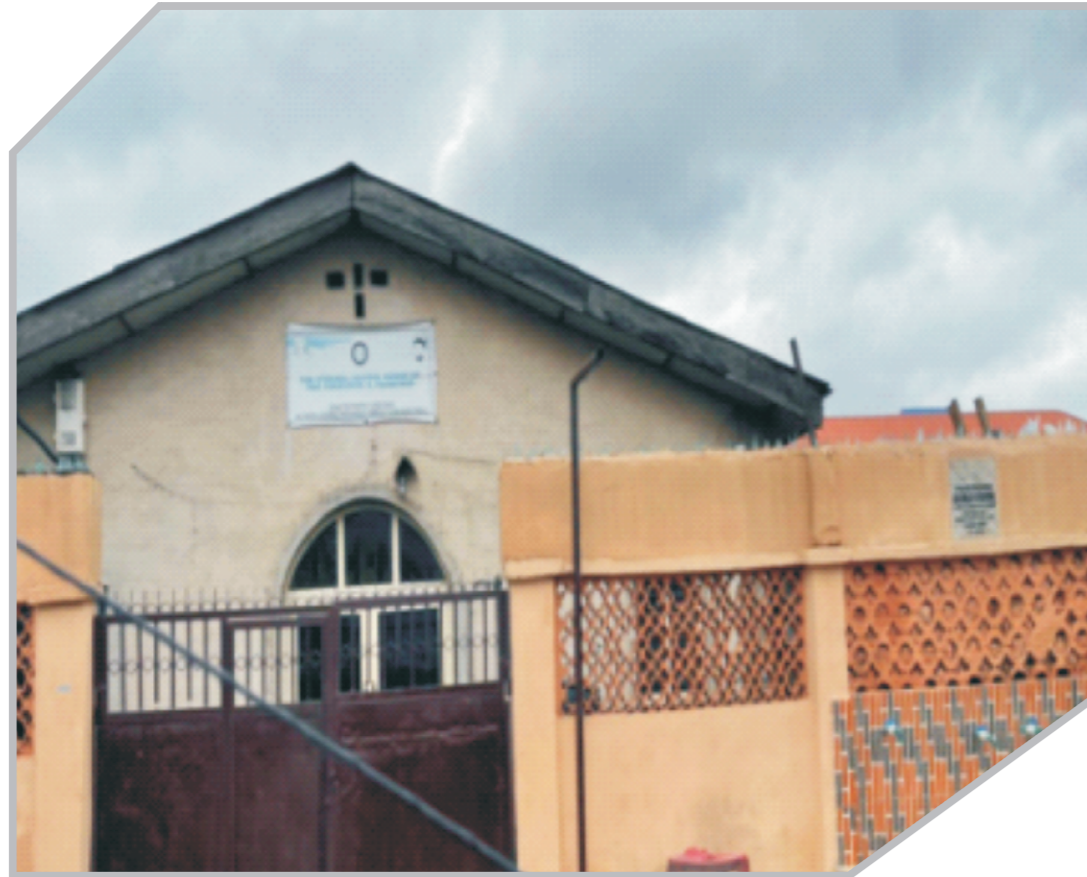
THE ETERNAL SACRED ORDER OF CERUBUM AND SERAPHIN. NO 15 ISHOLA STREET OFF CASINO CINEMA, ALAGOMEJI, YABA