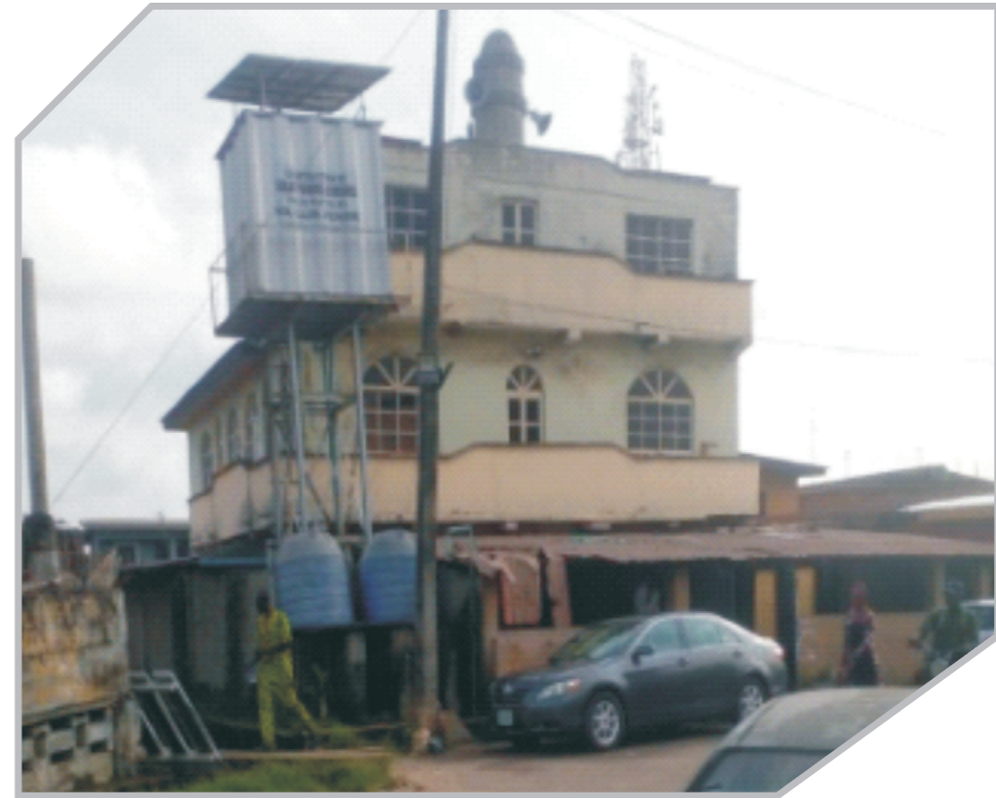
AJAYI BEMBE MOSQUE . ALONG AJAYI BEMBE, ABULE-OJA, YABA.