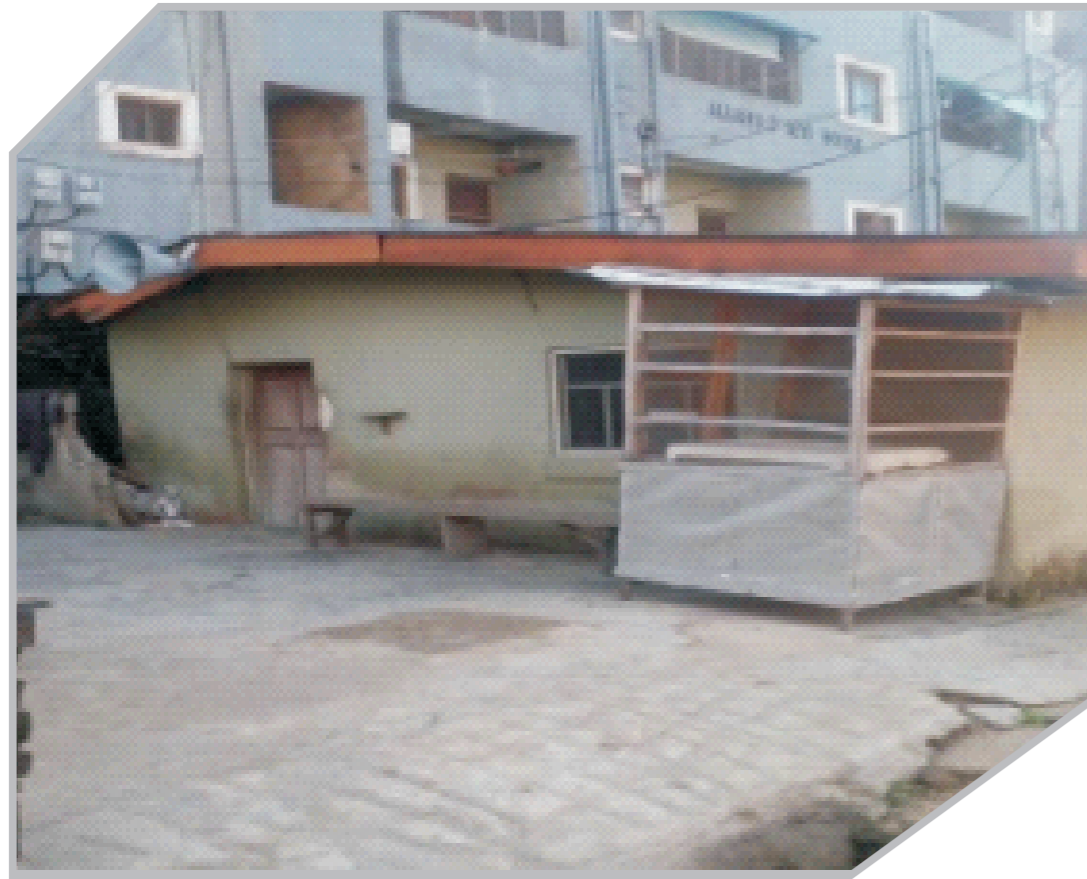
AHMADIYA MUSLIM JUMAT OF NIGERIA MOSQUE 1 ELEJI STREET, ABULE IJESHA.