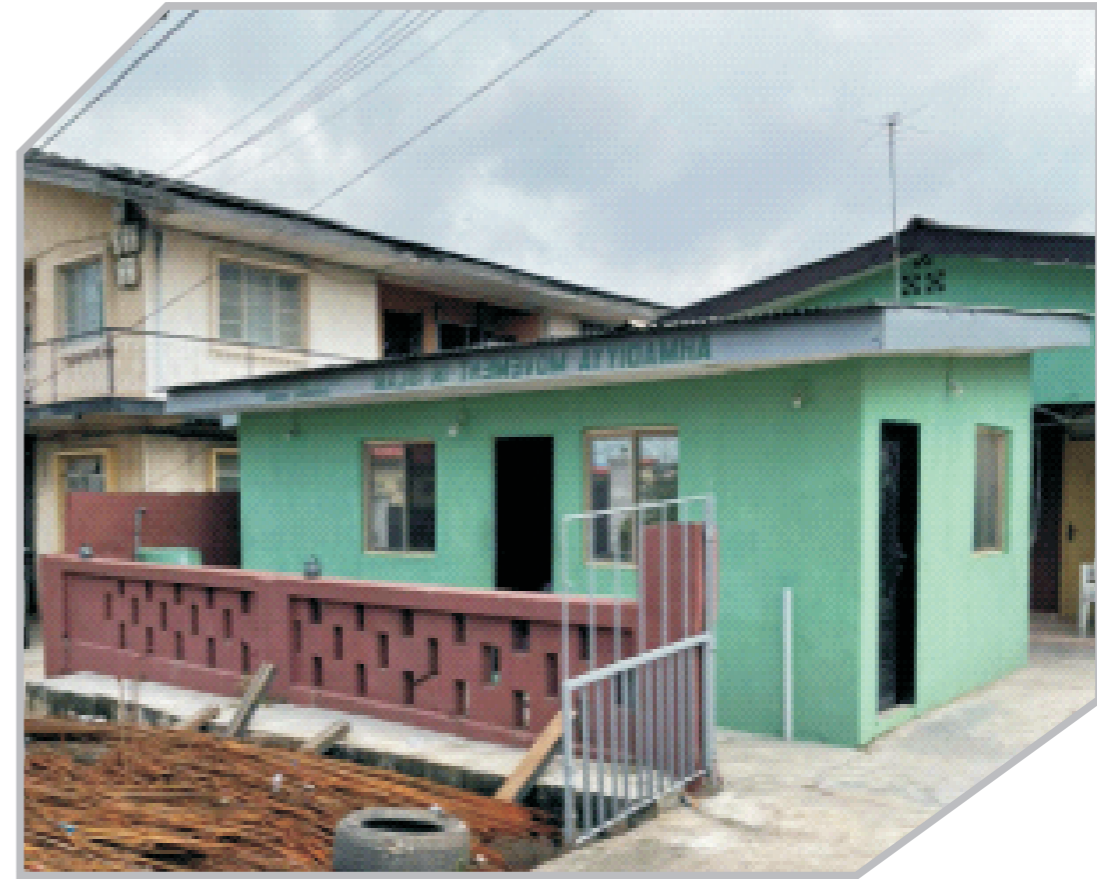
AHMADIYQ MOVEMENT MOSQUE. NO 49 ARAROMI STREET OFF BARIKISU IYEDE STREET, ONIKE, YABA.