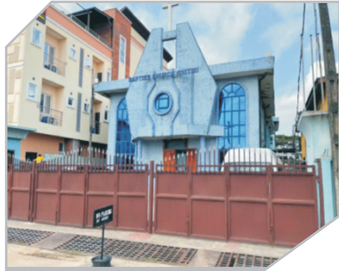
BAPTIST CHURCH. ONITIRI AT NO 14 LAWANI STREET, ONIKE, YABA