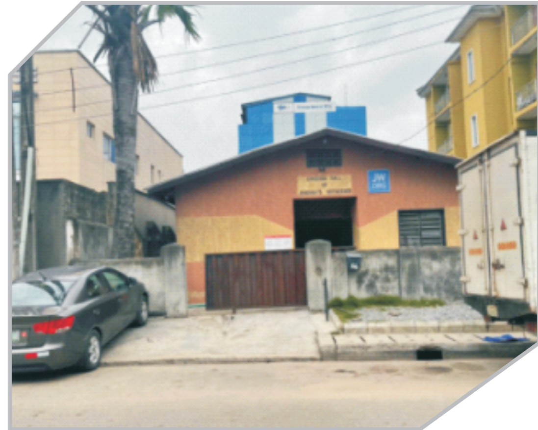
JEHOVAH WITHNESS CHURCH NO 64 OLD YABA ROAD, ADEKUNLE, YABA