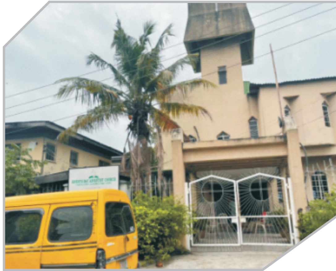
SEVETH DAY ADVENTIST NO 7 MOLEYE STREET BY OLD YABA ROAD, YABA