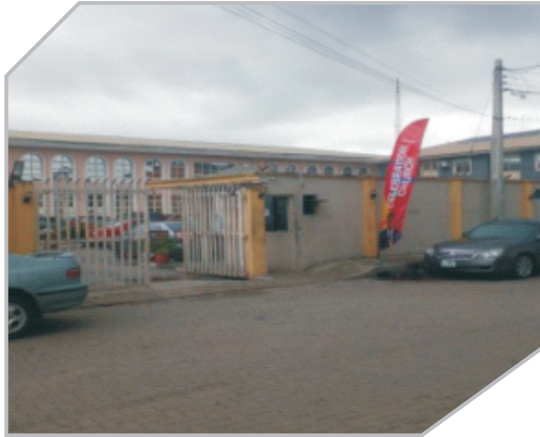
CELEBRATION CHURCH INTERNATIONAL. OFF CUSTODIAN STREET SABO, YABA.