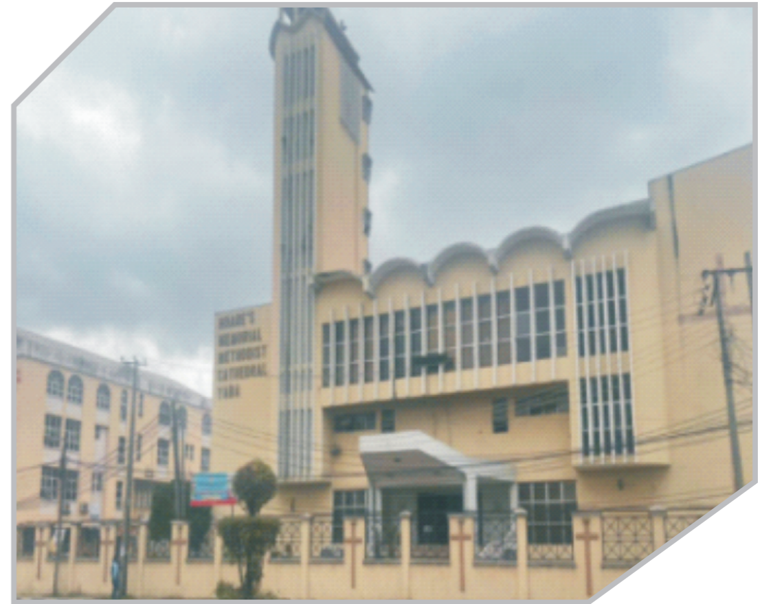
HOARSE MEMORIAL METHODIST CHURCH. HERBERT MACAULAY WAY, SABO, YABA.