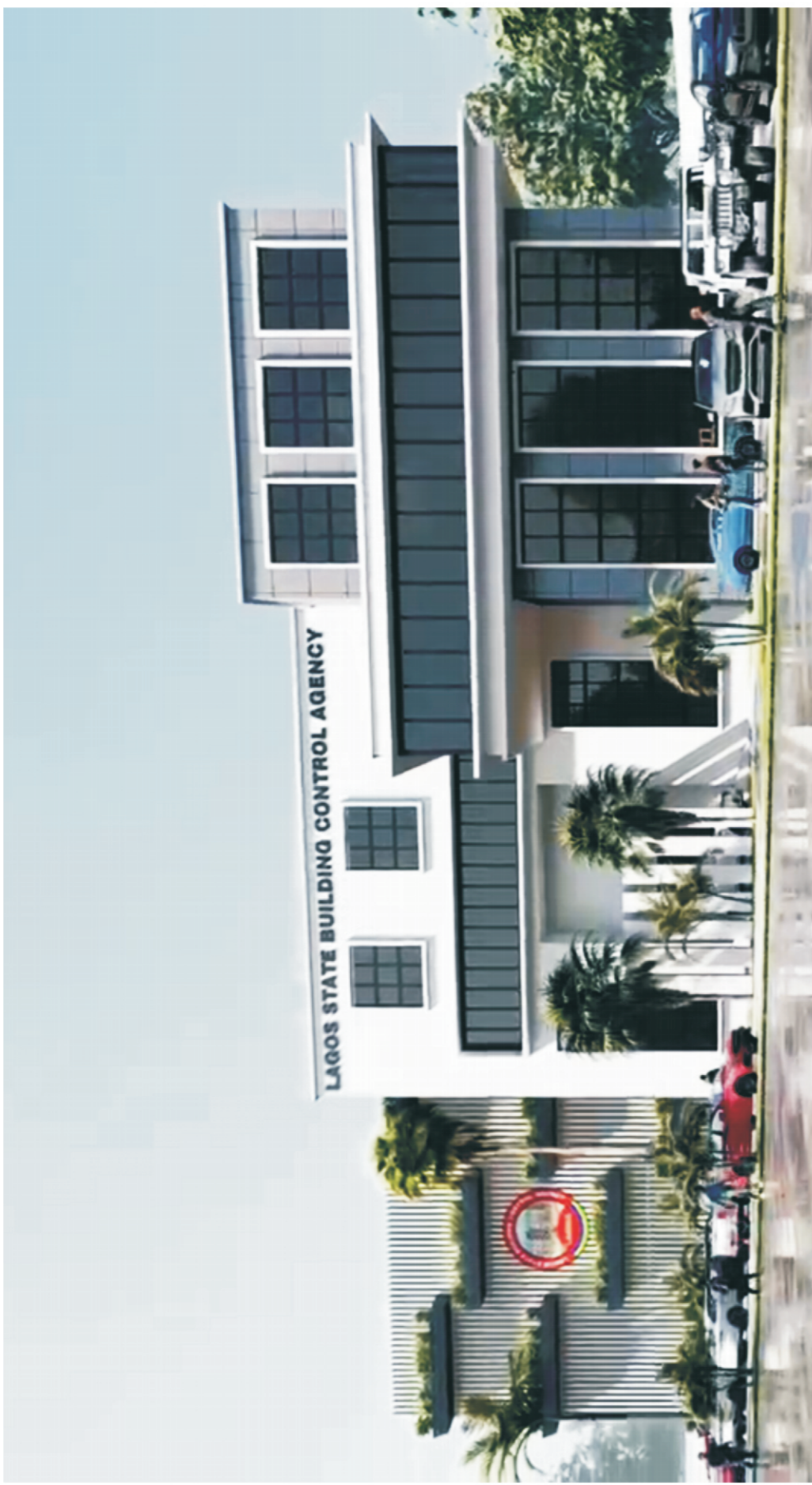
LAGOS STATE BUILDING CONTROL AGENCY 3D DRAWING .