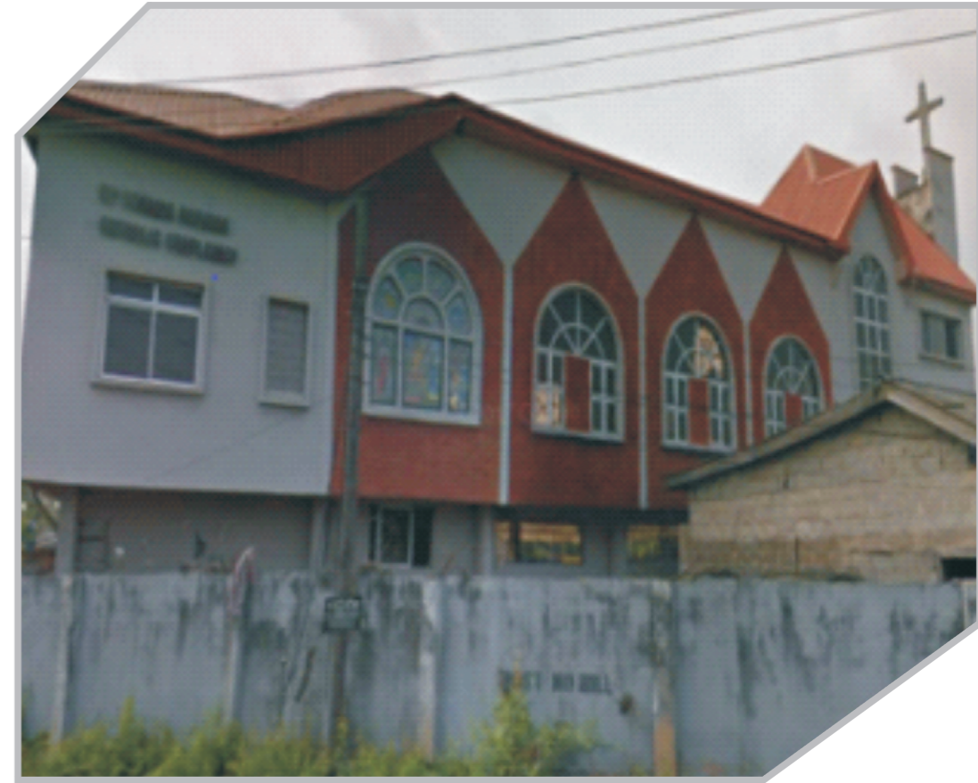
SAINT THOMAS ANGLICAN YABATECH YABA.