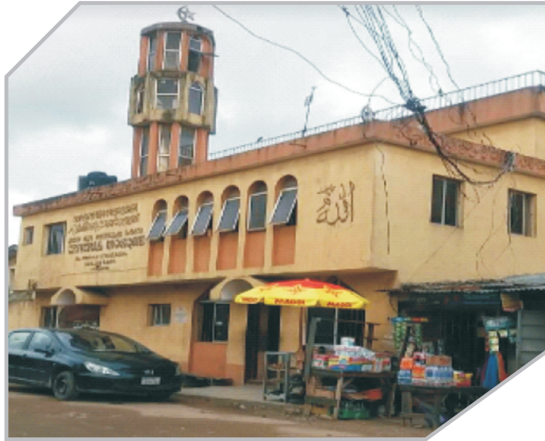
MAKOKO CENTRAL MOSQUE. MAKOKO ROAD YABA