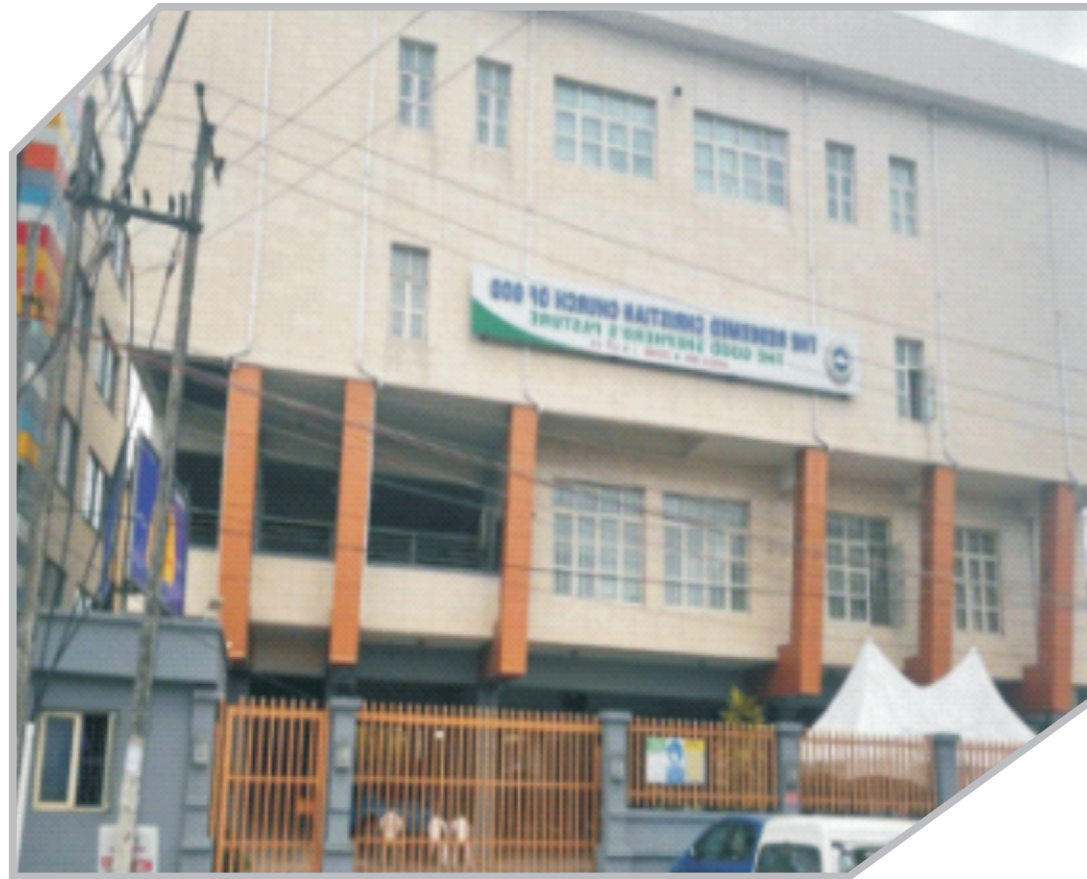
REDEEMED CHURCH. NO 232 HERBERT MACAULAY WAY, YABA.