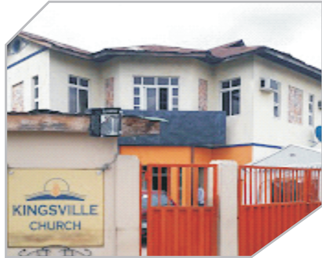
KINGSVILLE CHURCH. 2 AKINWUNMI STREET ALAGOMEJI YABA