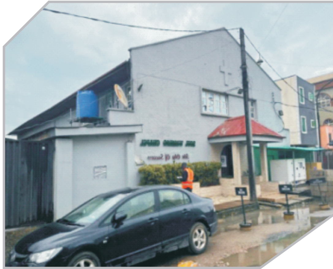
SOUL WINNING CHURCH . AT NO 277 BORNO WAY, YABA