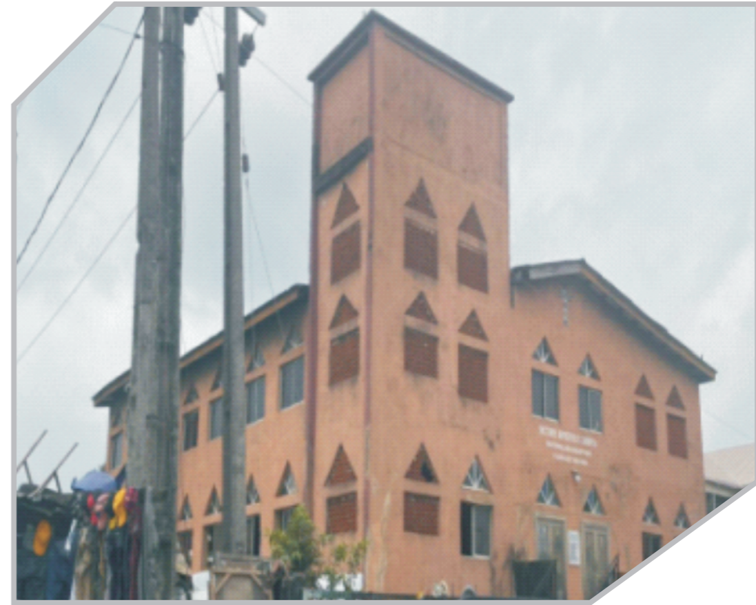
VICTORY APOSTOLIC CHURCH . NO 5/7 LANCASTER STREET BY ALARA STREET,SABO,YABA.