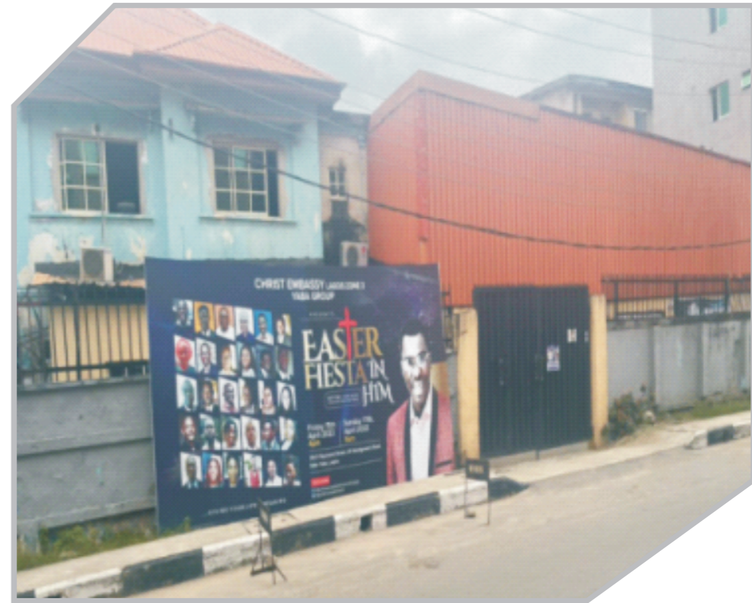
CHRIST EMBASSY. NO 25/27 RAYMOND STREET, SABO, YABA.