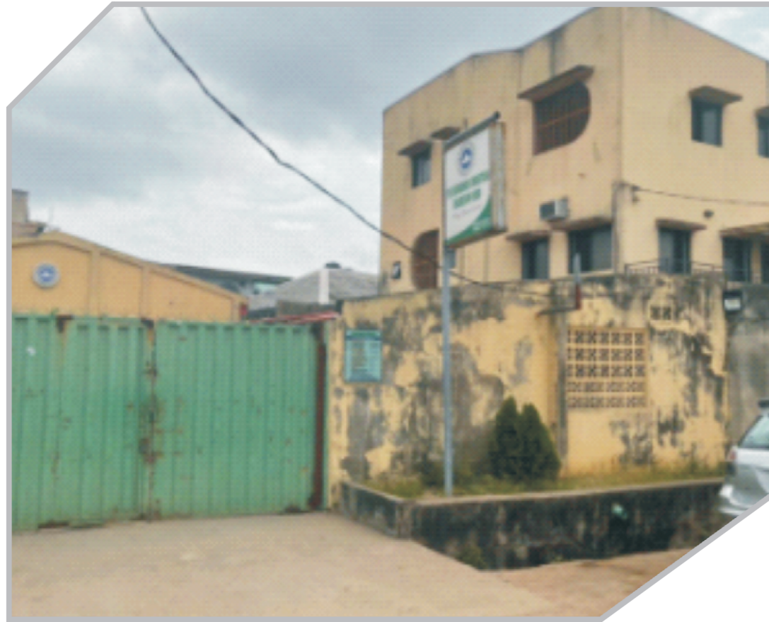
REDEEMED CHRISTIAN CHURCH. AT ANDOYI STREET, ONIKE, YABA