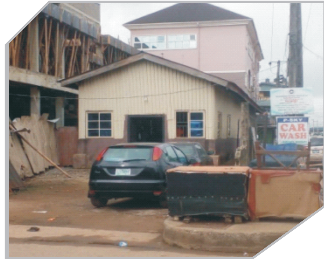
REDEEMED CHRISTIAN CHURCH OF GOD. (SOLID ROCK PARISH) NO 2, LATUNDE STREET, ADEKUNLE, YABA.