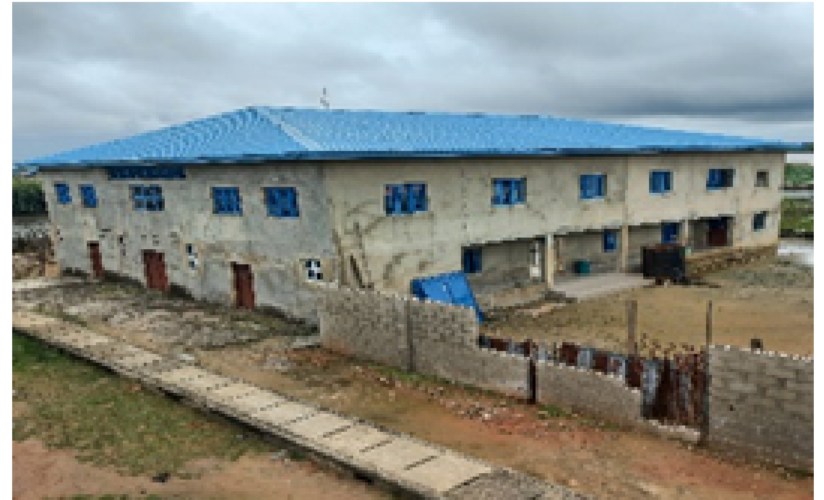
Un-named Church Along Ariyo street, beside Muwo bridge, Ira quarters, Ojo.