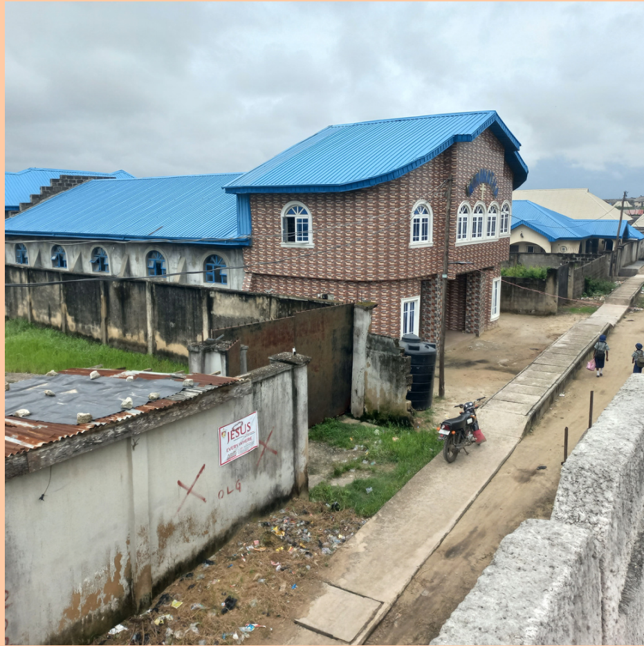
MARANATHA CHURCH ARIYO STREET, IRA QUATERS, OJO.