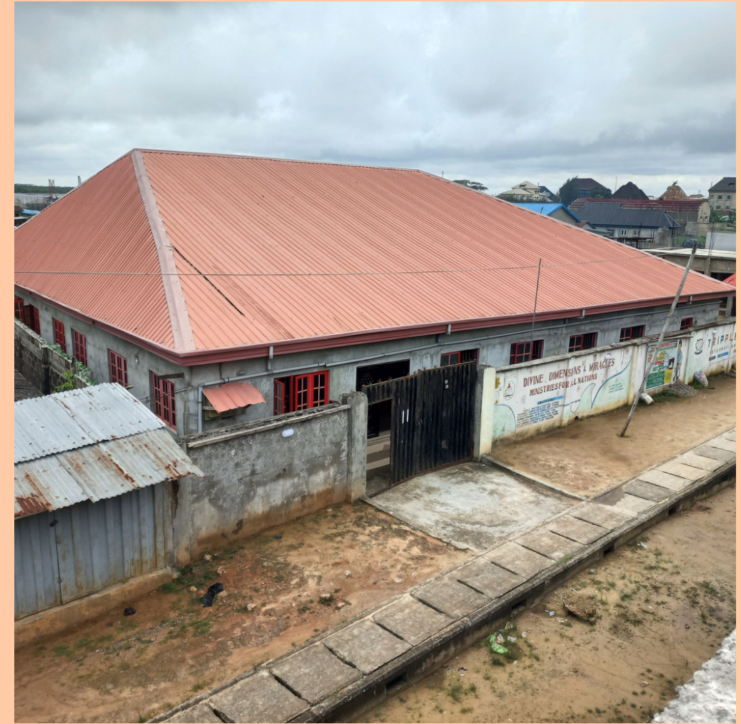
84 ARIYO ROAD, IRA QUATERS, OJO.