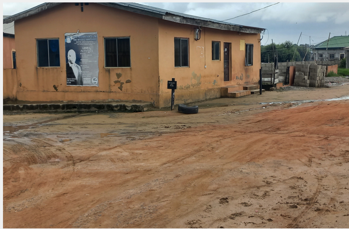
DIVINE RESTORATION OF END TIME MESSAGE MINISTRIES 13, EDM STREET MUWO, VOLKS BUS STOP, OJO