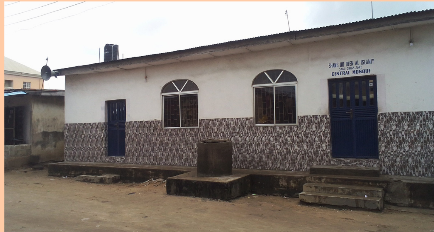
SHAMSHUDEEN AL ISLAMIY CENTRAL MOSQUE SABO ONIBA ZONE