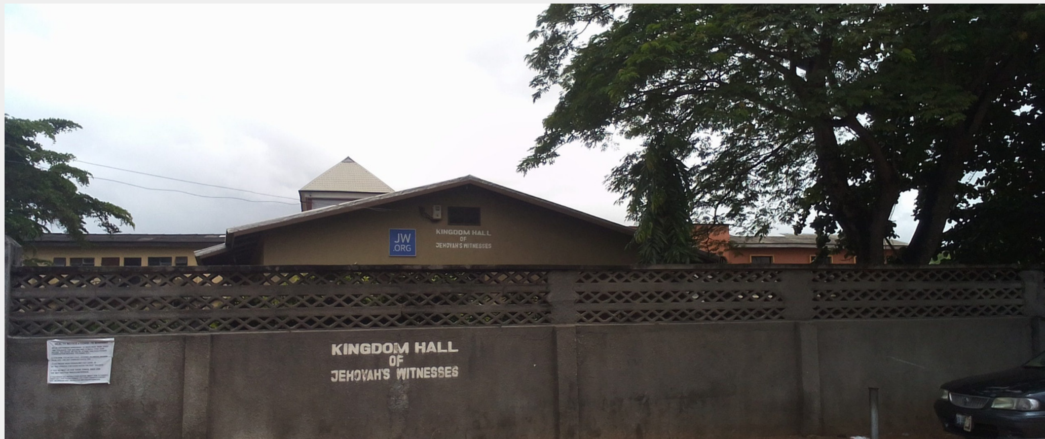
Kingdom Hall of Jehova Withness Along Tesubi Close, Mosafejo, Ojo