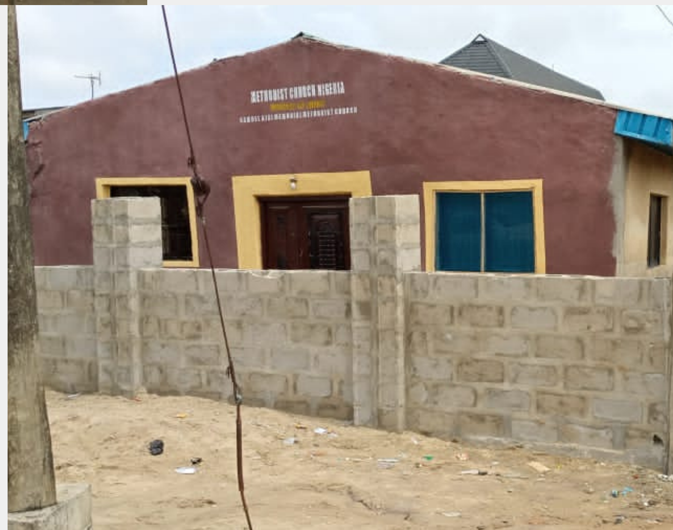
Methodist church of Nigeria Along Habeeb street, Ira quaters, Ojo.