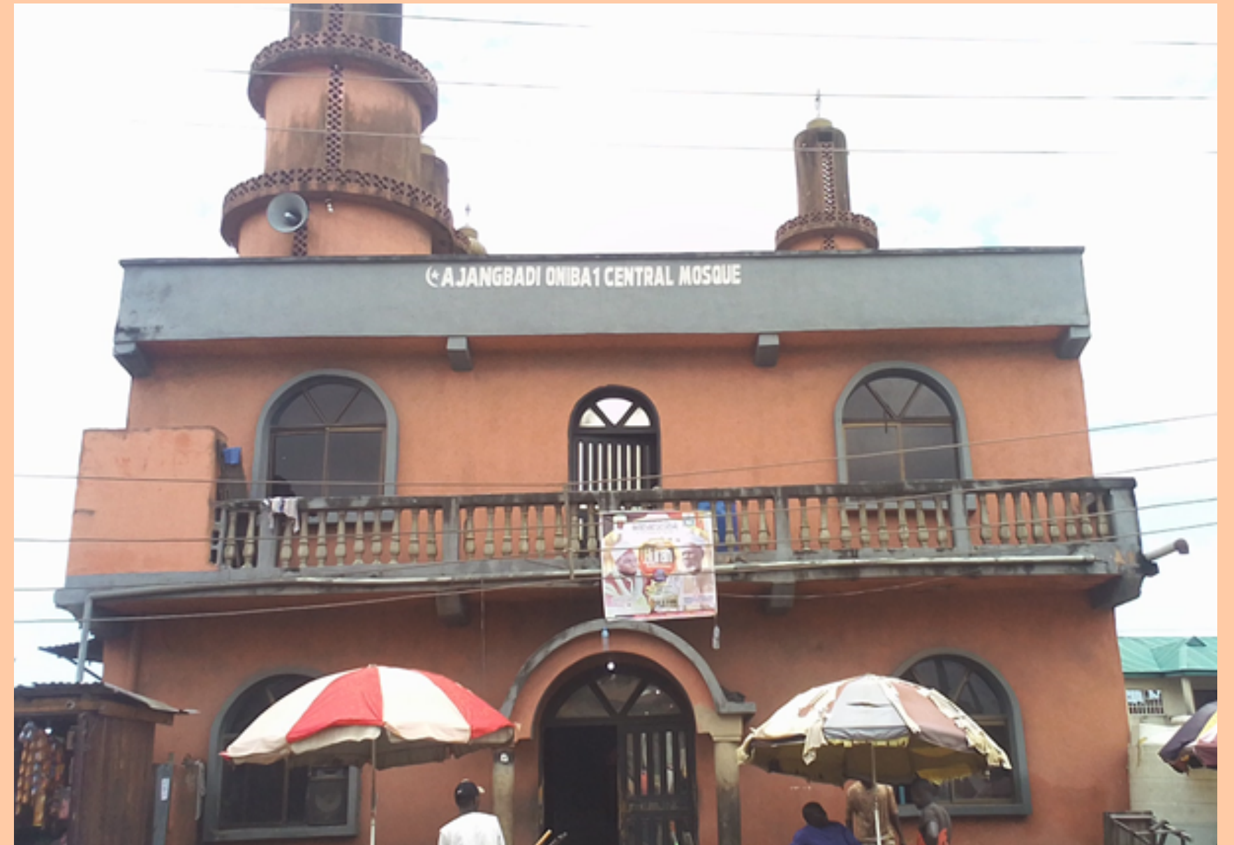
THIS IS A MOSQUE WITH 2 FLOORS, IT DOES NOT HAVE: