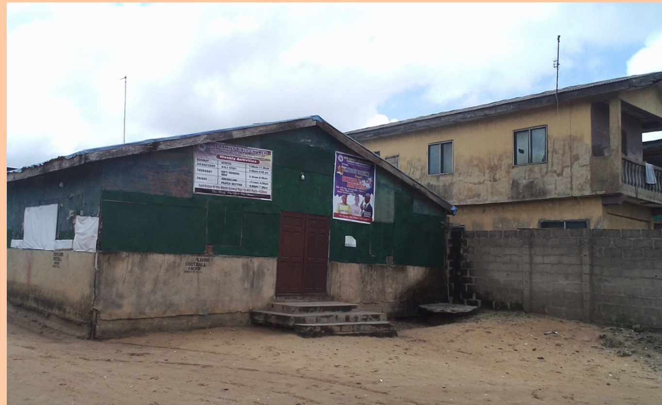
ONE FAMILY BIBLE CHURCH 6 ADEGOR STR., OFF OBAGORIOLA SABO, AJAGBANDI