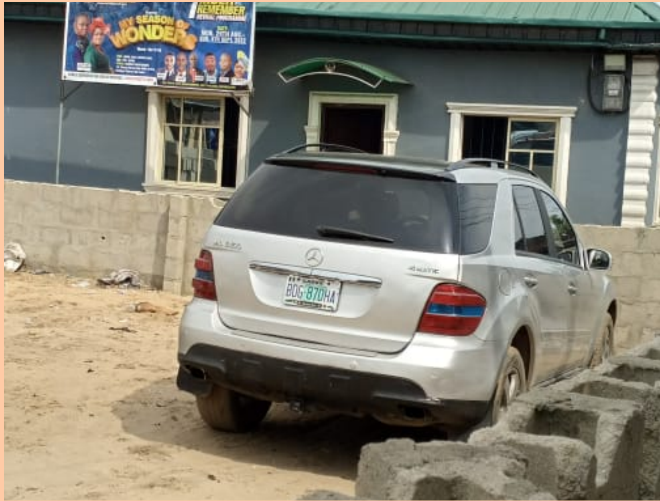
Chapel of Praise & Prayer Ministry Int. Inc 18 Church street, VOLKS BUS STOP, OJO