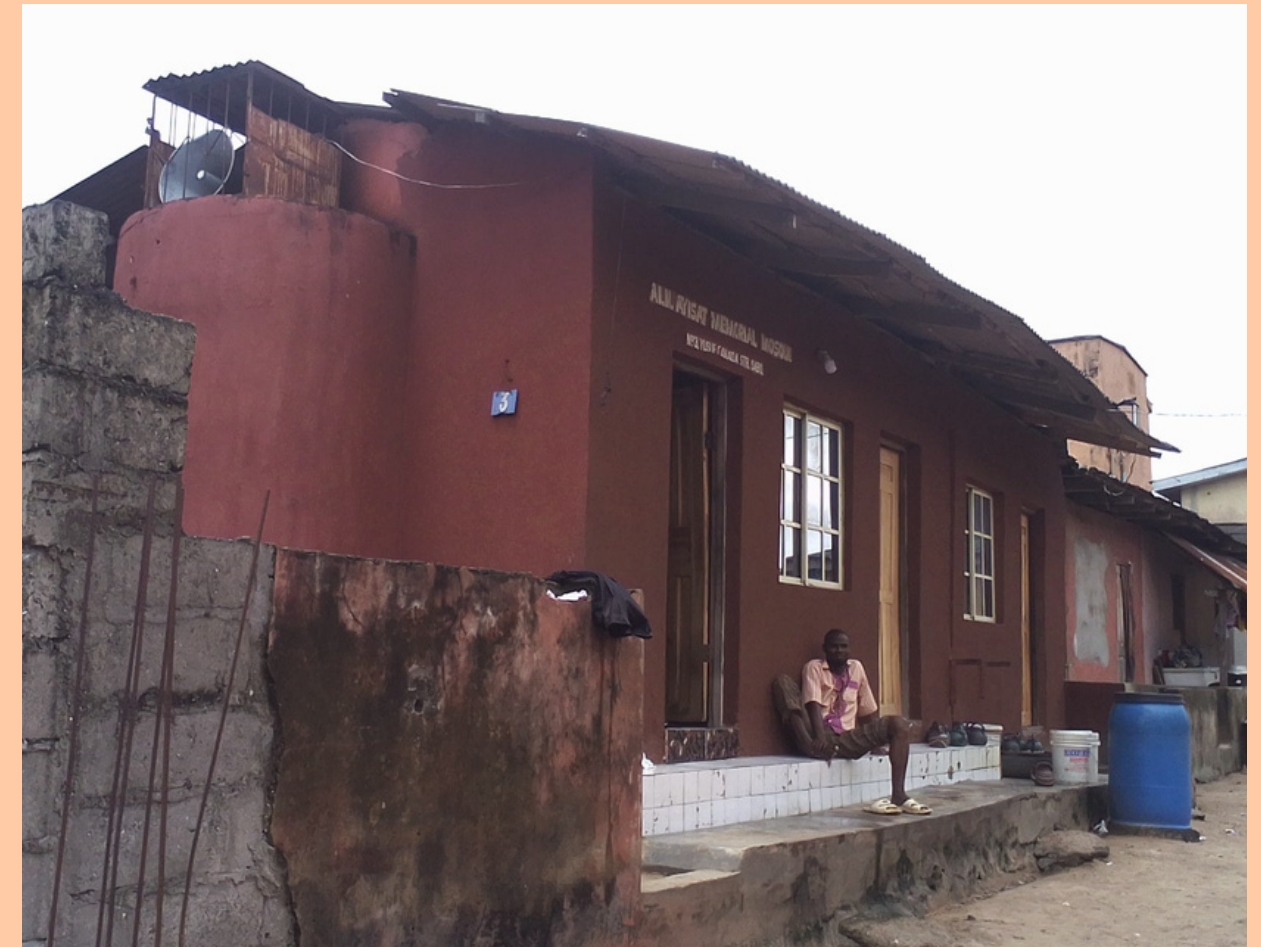
ALH. AYISAT MEMORIAL MOSQUE NO. 3 YUSUF AKANDA STR. SABO.