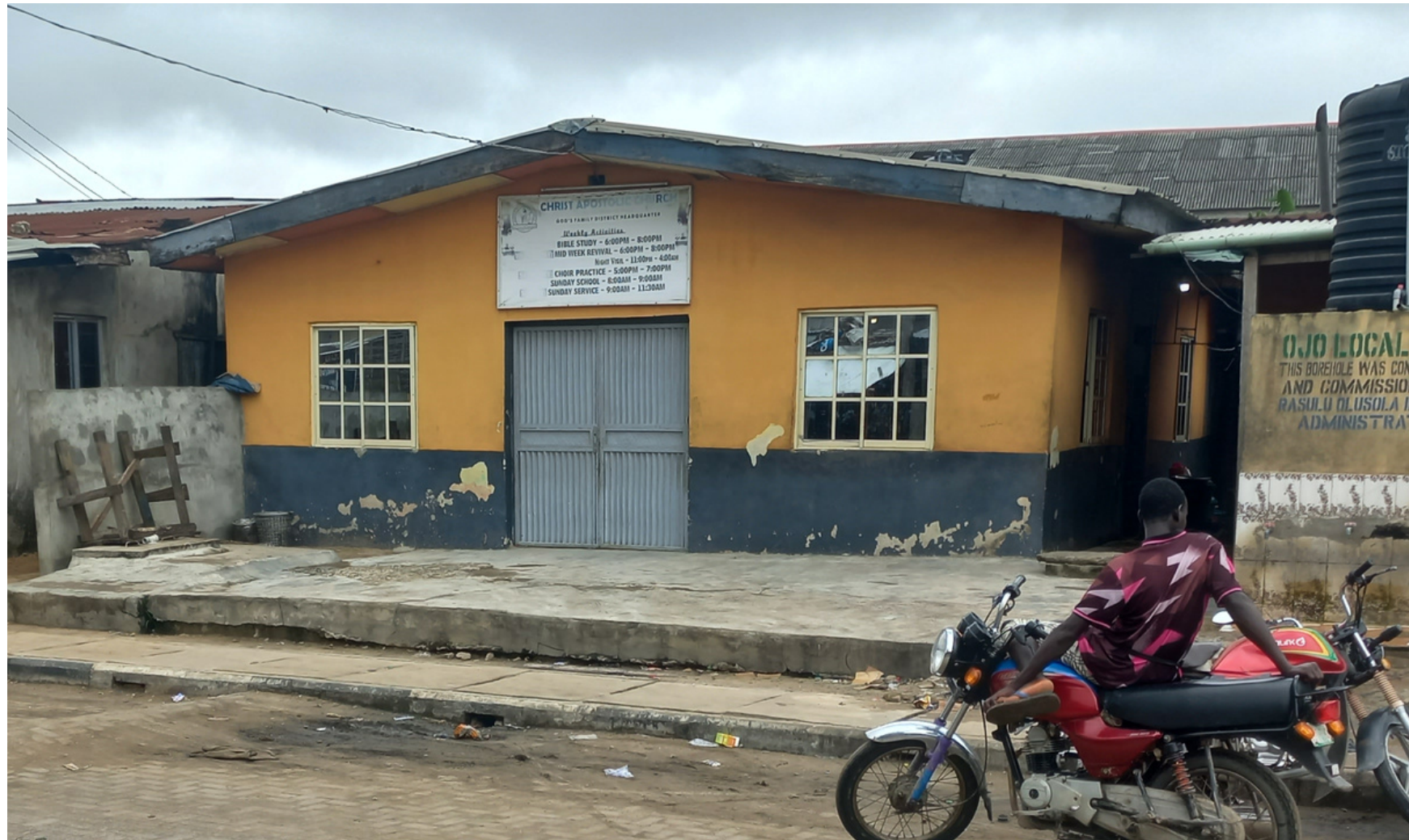
Christ Apostolic Church Along Muwo- Tedi Road, Muwo town, Ojo.