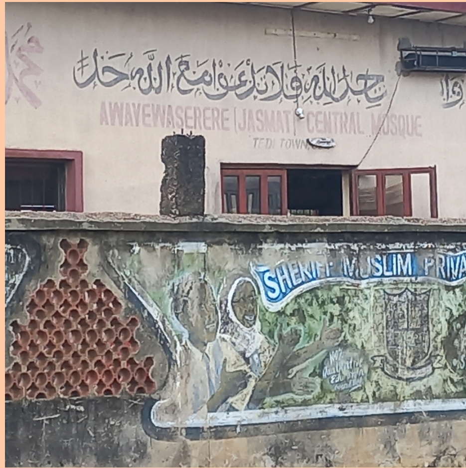
AWAYEWASERERE JASMAT CENTRAL MOSQUE