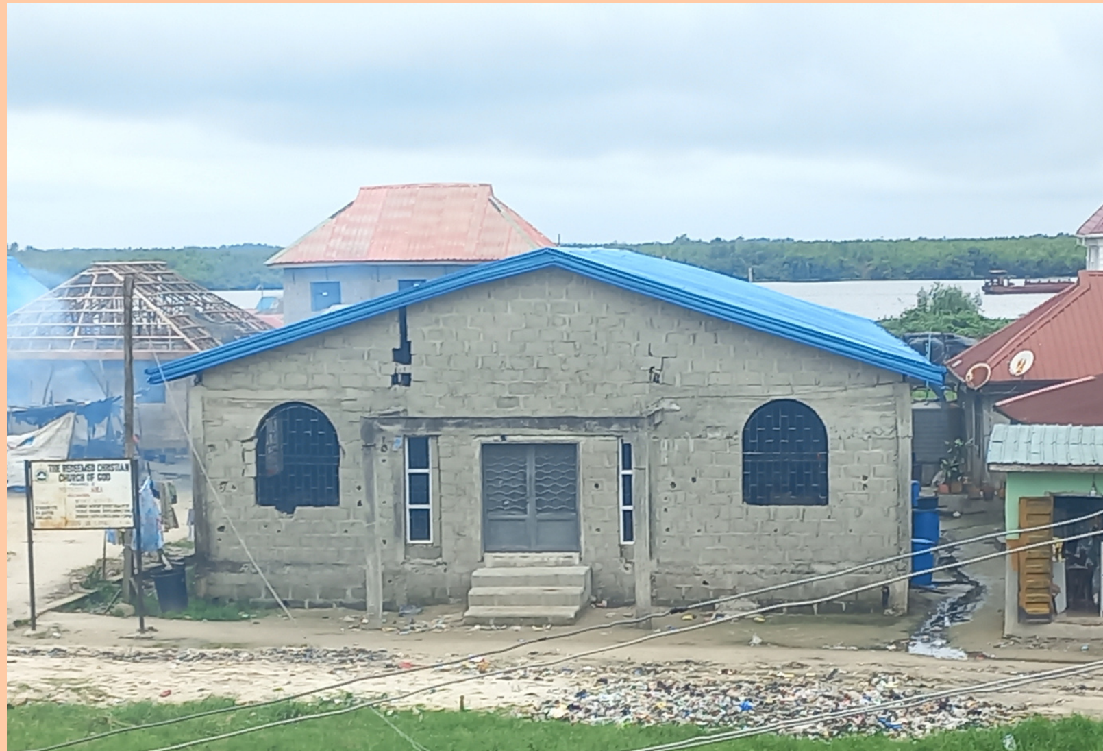
The Redeemed Christian church of God Along Ariyo street, beside Muwo bridge, Ira Quaters, Ojo.