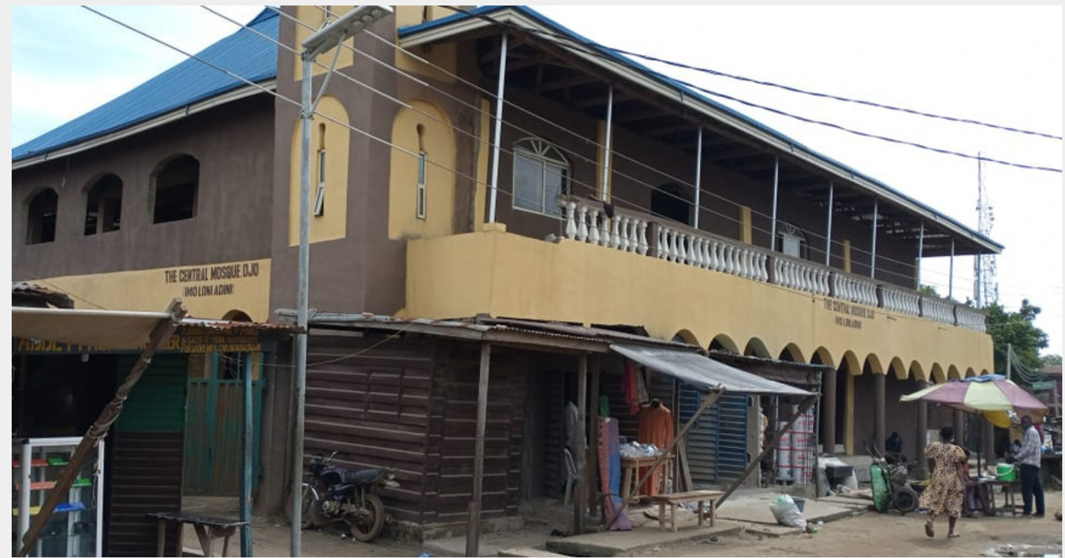
OJO CENTRAL MOSQUE OJO