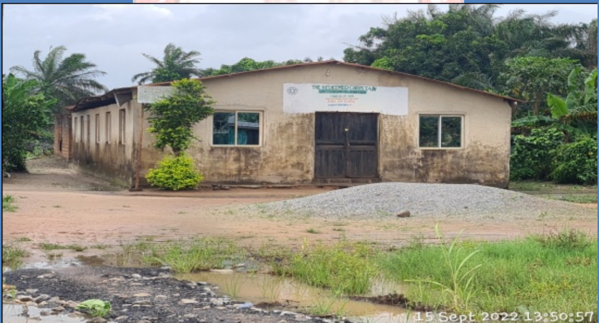
NAME: THE REDEEMED CHRISTAIN CHURCH OF GOD ADDRESS: ALONG EPE IKORODU ROAD, ITOKIN, EPE DEFECTS: DAMPNES NOTICED