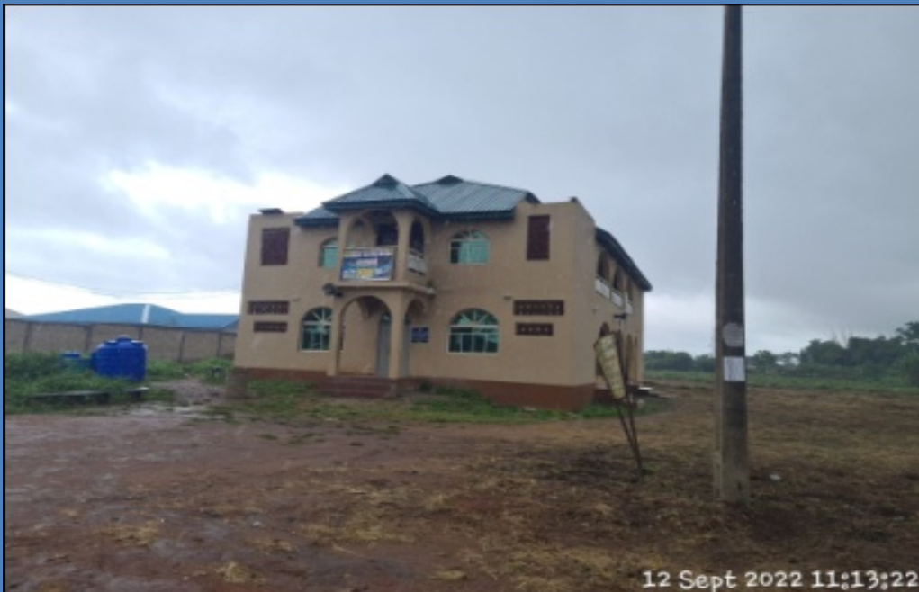
NAME: ALFA BASHURA JEGEDE ALOWODU OSI-EFA MEMORIAL CENTRAL MOSQUE ADDRESS: ALONG IRAYE ROAD, IRAYE OKE, EPE DEFECTS: NIL