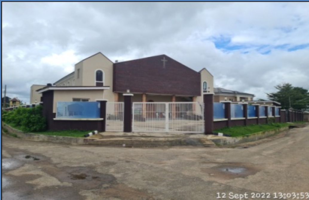
NAME: ST. PETERS CATHOLIC CHURCH (QUASI PARISH) ADDRESS: ODORAGA STREET, ODORAGUNSHIN, EPE DEFECTS: NIL