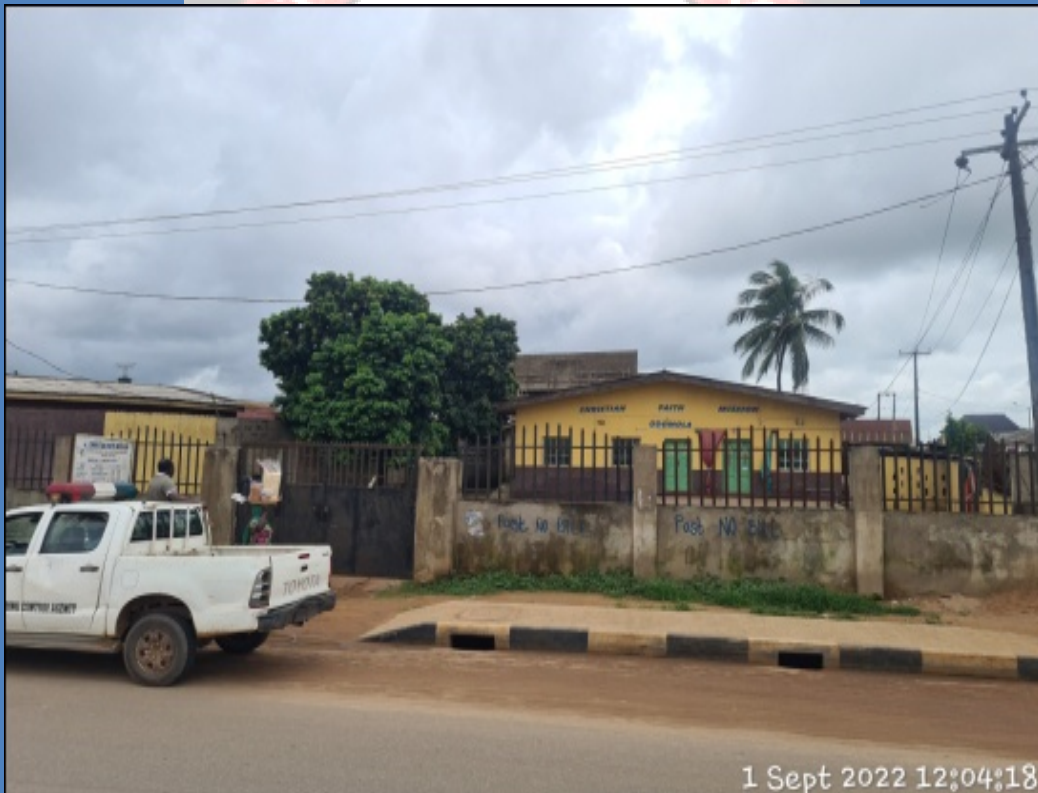
NAME: CHRISTAIN FAITH MISSION ADDRESS: ALONG EPE IJEBU ODE ROAD, ODOMOLA, EPE DEFECTS: NIL