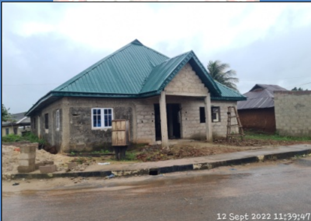
NAME: CHRIST CHURCH OF C & S ADDRESS: ODO EGIRI, EPE LAGOS STATE DEFECTS: NIL