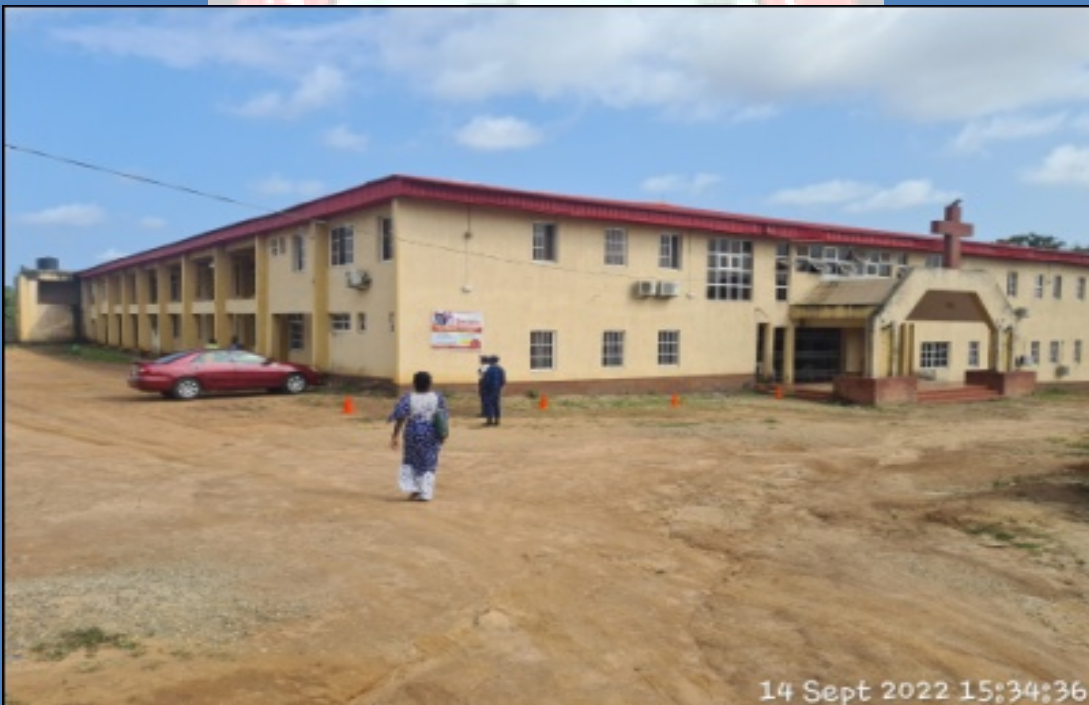
NAME: LIVING FAITH CHURCH (WINNERS CHAPEL) BESIDE HOLY TRINITY ANGLICAN CHURCH ADDRESS: ERASCO, OFF LAGOS ROAD, EPE DEFECTS: NIL