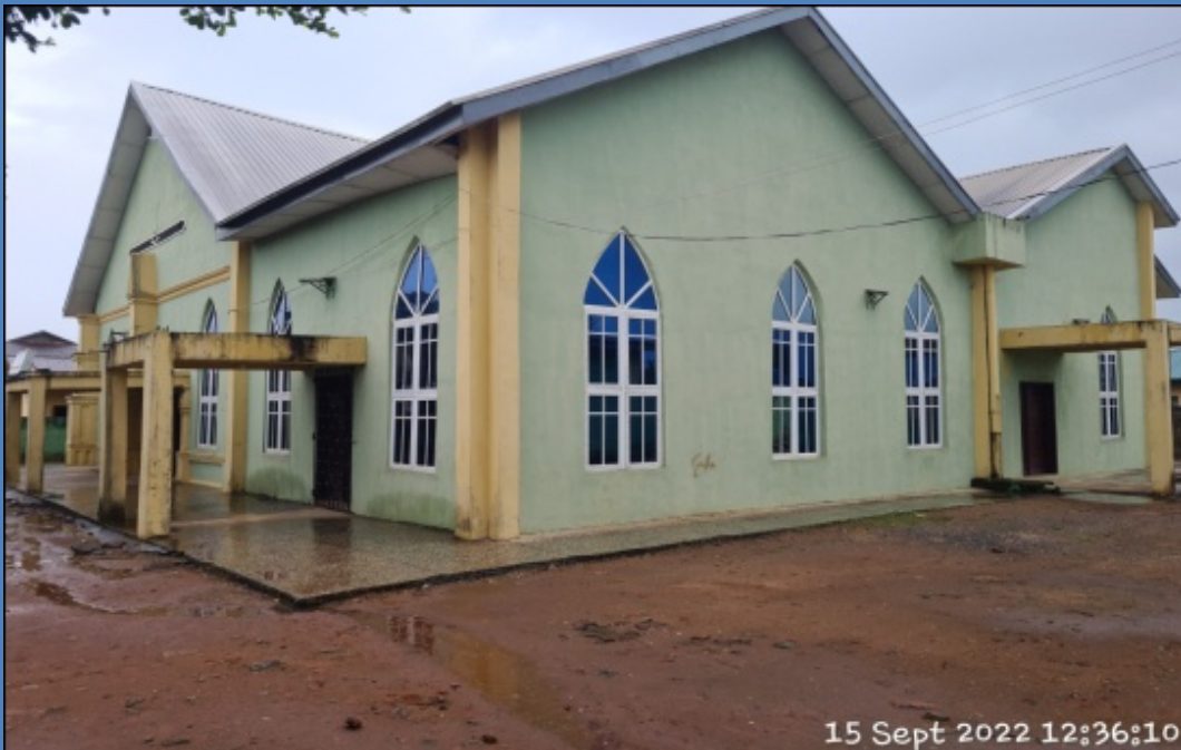
NAME: FIRST BAPTIST CHURCH (SANCTUARY OF GRACE & GLORY) ADDRESS: 94, IKOSI BEACH ROAD, AGBOWA, IKOSI EJIRIN LCDA, EPE DEFECTS: NIL