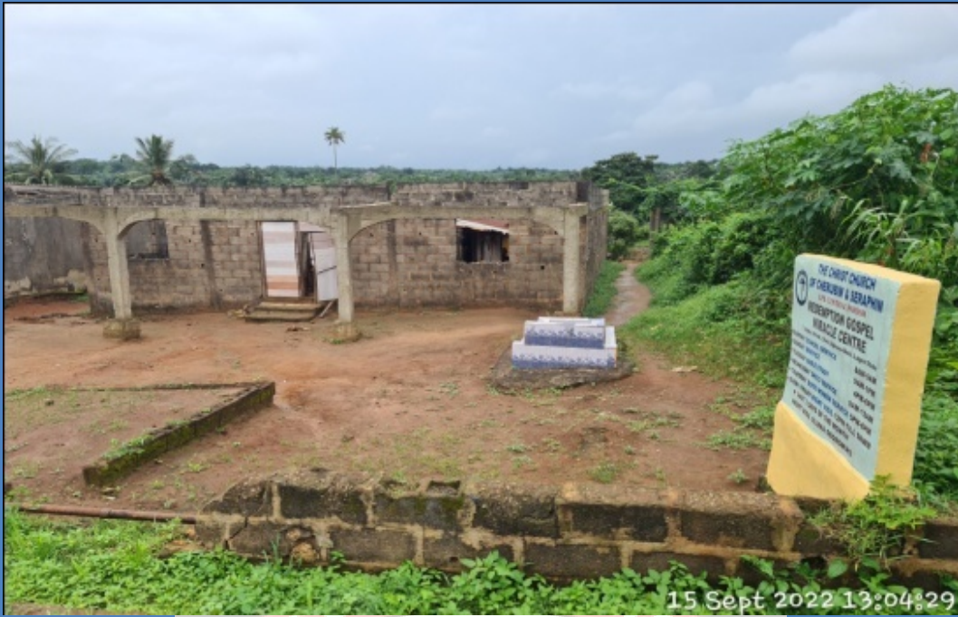
NAME: THE CHRIST CHURCH OF CHERUBIM AND SERAPHIM ADDRESS: 7, MODU STREET, OWU-AGBOWA IKOSI, EPE DEFECTS: NIL