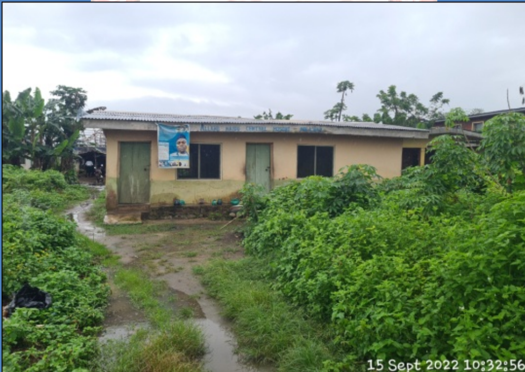
NAME: ALLAHU WAIDU CENTRAL MOSQUE ADDRESS: EPE ITOKIN MOLAJOYE, EPE DEFECTS: DAMPNES NOTICED