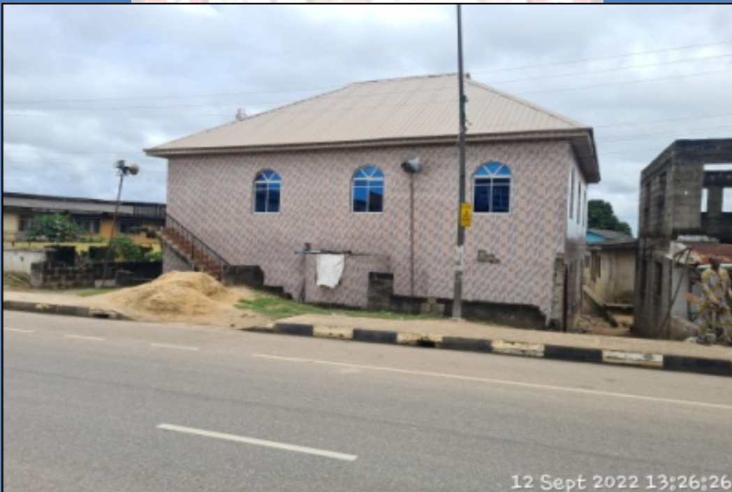
NAME: CENTRAL MOSQUE ADDRESS: ALONG LAGOS ROAD, OPPOSITE SUNFLASH PLAZA, EPE DEFECTS: NIL