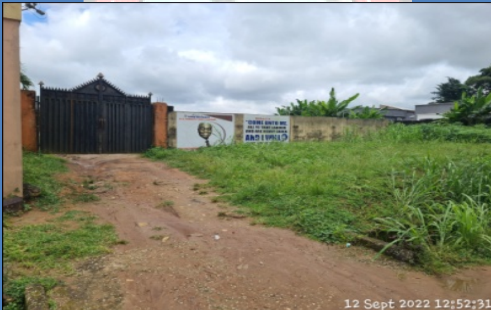
NAME: LIVING FAITH CHURCH (A.K.A WINNERS CHAPEL) ADDRESS: ALONG MOJODA/ IBONWON ROAD, EPE DEFECTS: NIL