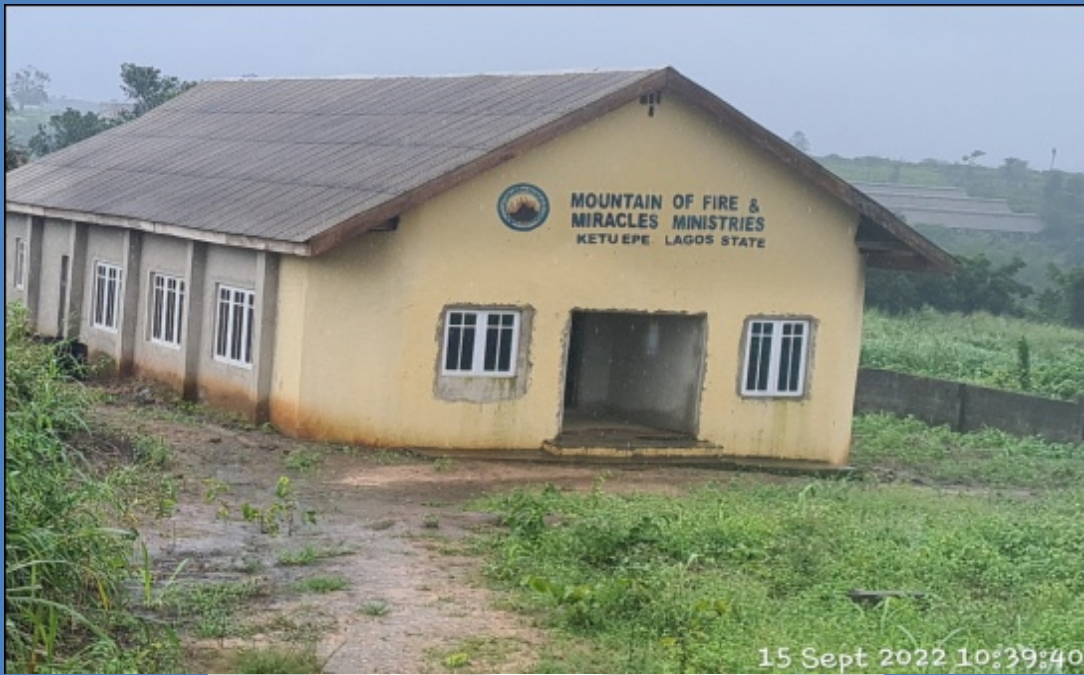
NAME: MOUNTAIN O FIRE & MIRACLES MINISTRIES ADDRESS: KETU, EPE DEFECTS: DAMPNES NOTICED