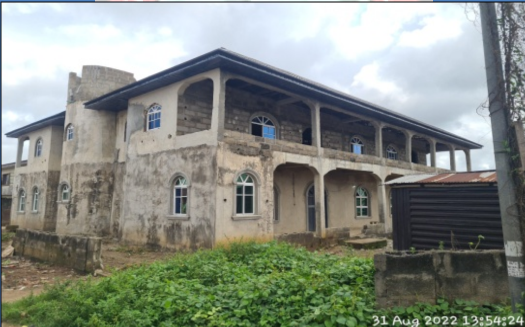
NAME: OLORUNLOBA CENTRAL MOSQUE ADDRESS: ALONG M.O OKUNBANJO STREET BY OSHINOWO JUNCTION, EPE DEFECTS: DAMPNES NOTICED