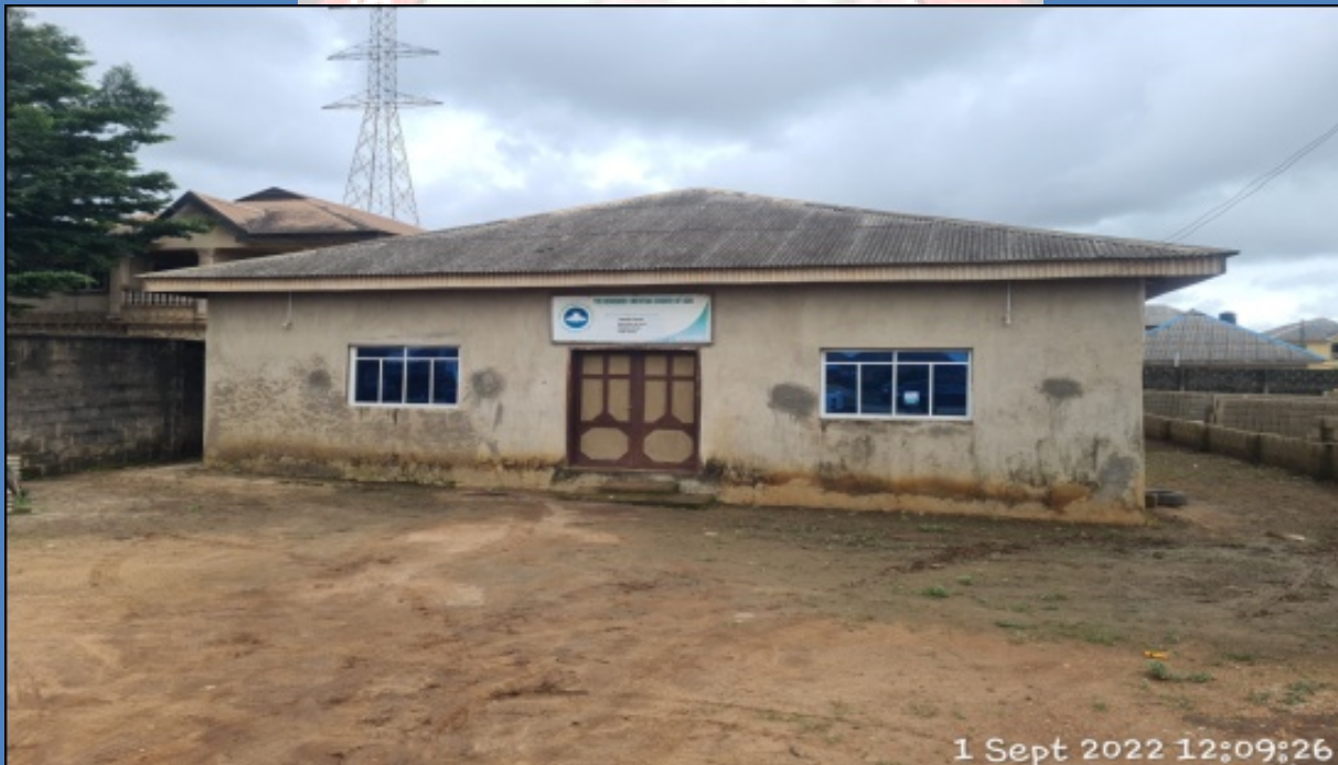
NAME: THE REDEEMED CHRISTAIN CHURCH OF GOD ADDRESS: ALONG EPE IJEBU ODE ROAD, ODOMOLA, EPE DEFECTS: DAMPNES NOTICED