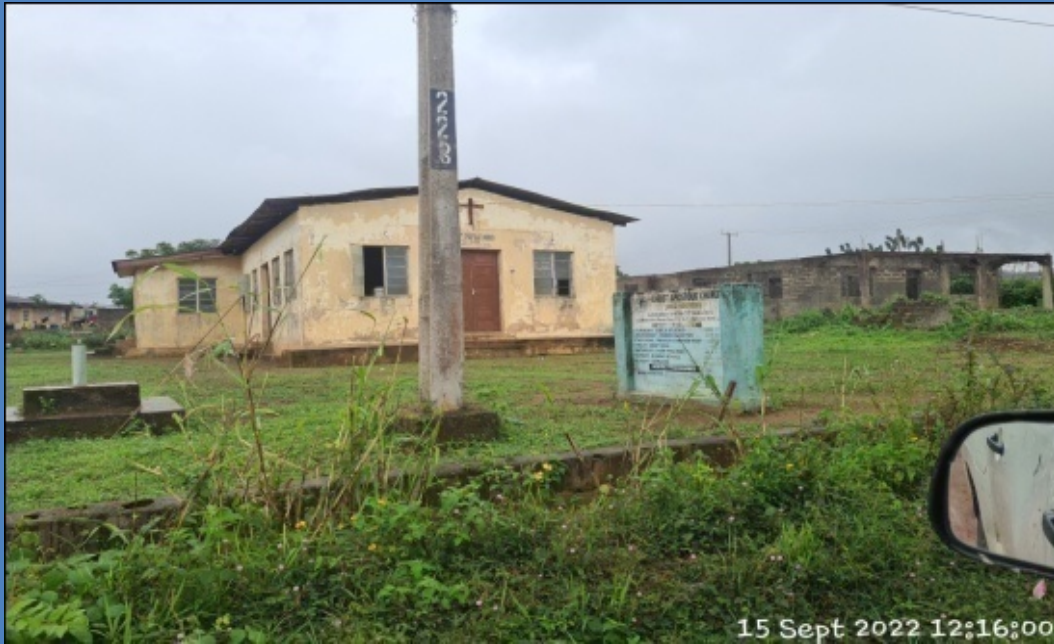
NAME: CHRIST APOSTOLIC CHURCH ADDRESS: 32 METHODIST ROAD, OPPOSITE PRIMARY SCHOOL, AGBOWA, EPE DEFECTS: NIL