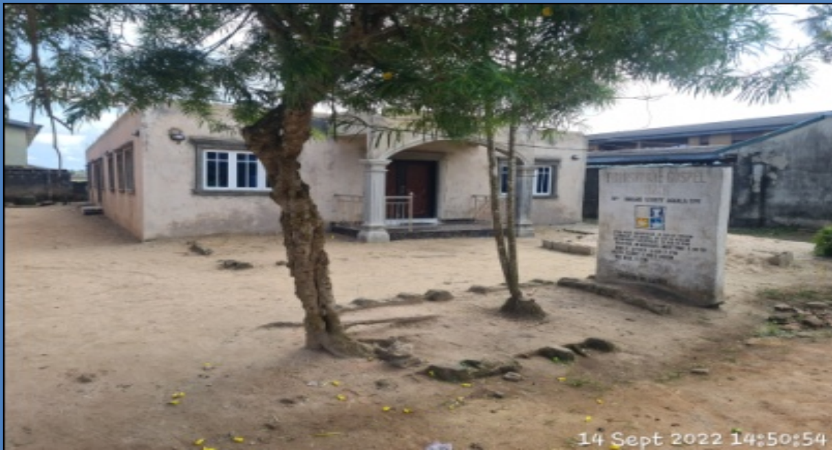
NAME: FOURSQUARE GOSPEL CHURCH ADDRESS: 3, BAKARE STREET, AGBALA SOLOMON, EPE DEFECTS: DAMPNES NOTICED