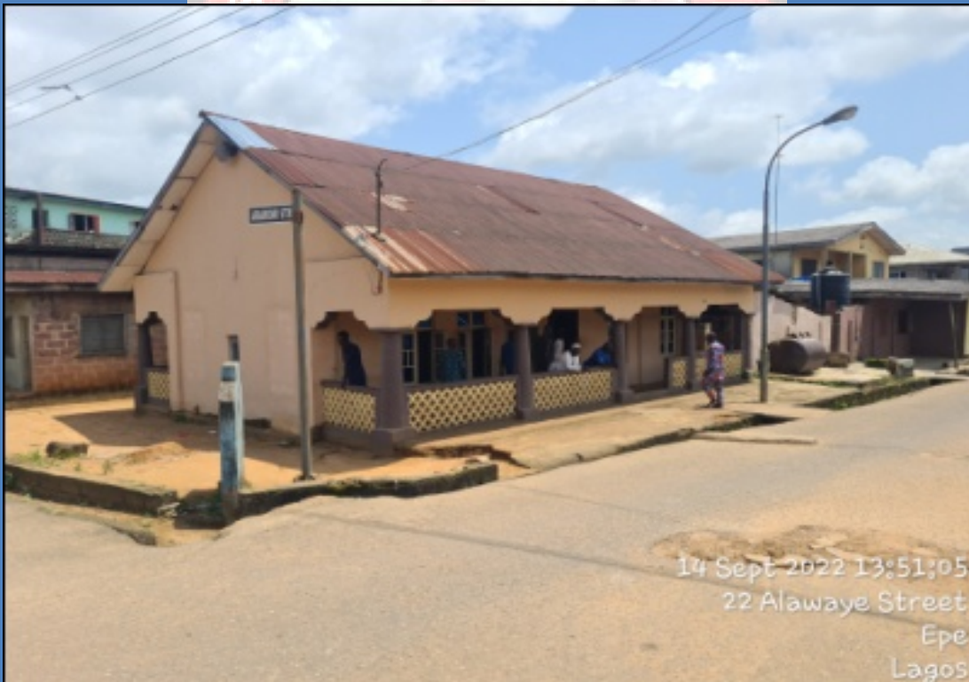
NAME: EXISTING MOSQUE ADDRESS: ARAROMI STREET, EPE DEFECTS: NIL