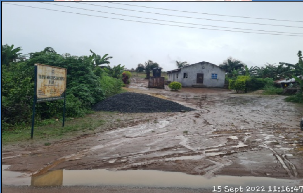
NAME: THE REDEEMED CHRISTAIN CHURCH OF GOD ADDRESS: ERERUFU, AGBOWA, IKOSI EJIRIN LCDA, EPE DEFECTS: NIL