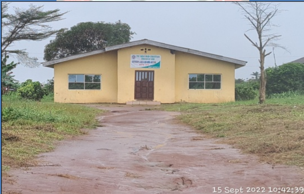
NAME: THE REDEEMED CHRISTAIN CHURCH OF GOD ADDRESS: KETU, EPE DEFECTS: NIL