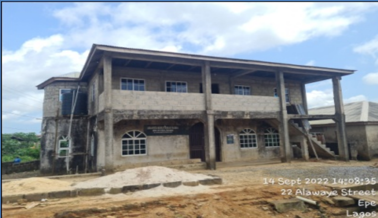
NAME: AHMADIYYA MUSLIM JAMA'AT CENTRAL MOSQUE OF NIGERIA ADDRESS: ALONG OKE-OWODE STREET, EPE LAGOS STATE DEFECTS: NIL