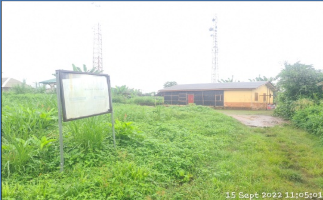
NAME: LIVING FAITH CHURCH (WINNER'S CHAPEL INTL) ADDRESS: EPE ITOKIN ROAD, KETU, EPE DEFECTS: NIL