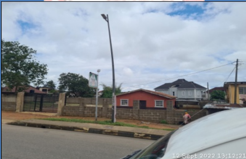
NAME: THE REDEEMED CHRISTAIN CHURCH OF GOD ADDRESS: AIYETORO ROAD, ITAMARUN, EPE DEFECTS: NIL