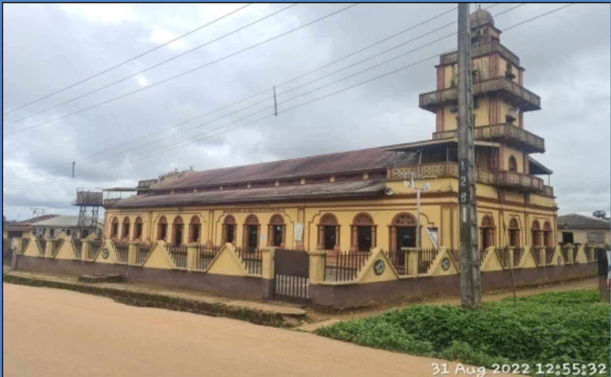
NAME: FIRST EPE CENTRAL MOSQUE ADDRESS: ALONG CENTRAL MOSQUE ROAD, OKE BALOGUN, EPE DEFECTS: NIL