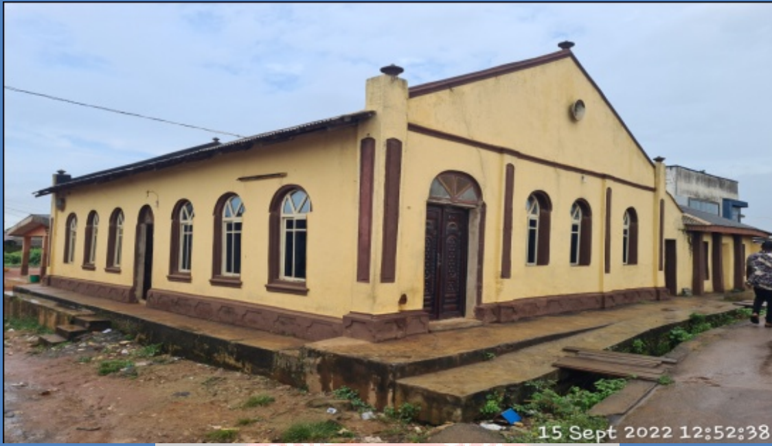
NAME: EXISTING MOSQUE ADDRESS: IKOSI BEACH ROAD, AGBOWA IKOSI, EPE DEFECTS: NIL