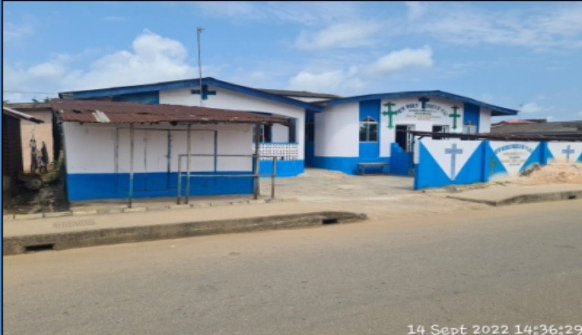
NAME: NEW WORLD CHURCH OF PEACE (ALADURA PARISH II) ADDRESS: KASALI OLUWO STREET, PAPA, EPE DEFECTS: NIL