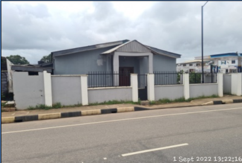
NAME: OUR SAVIOUR'S CHURCH ADDRESS: ODORAGUNSHIN, EREDO, EPE DEFECTS: NIL