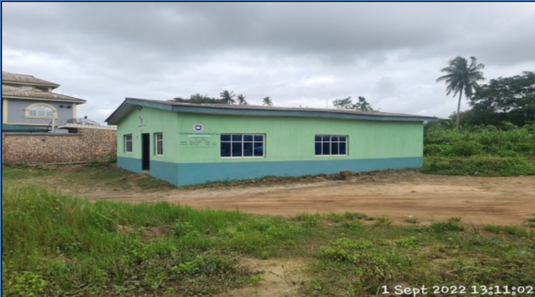
NAME: THE REDEEMED CHRISTAIN CHURCH OF GOD (SANCTUARY OF REDEMPTION, LAGOS PROVINCE 39) ADDRESS: ALONG EPE IJEBU ODE ROAD, EREDO, EPE DEFECTS: NIL