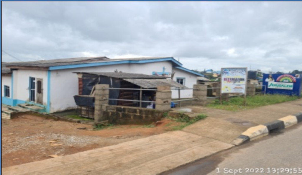
NAME: CELESTIAL CHURCH OF CHRIST (NEW JERUSALEM PARISH) ADDRESS: EPE IJEBU ODE ROAD, ODOSHIWOLA, EREDO, EPE DEFECTS: NIL