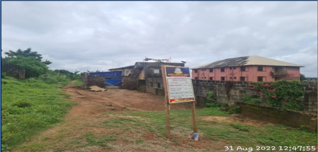
NAME: GOSPEL CHURCH OF CHRIST ADDRESS: AWOLOWO ROAD, EPE DEFECTS: MADE OF SHANTIES