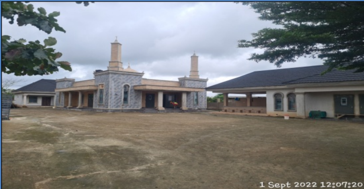
NAME: PROPOSED MOSQUE ADDRESS: ALONG EPE IJEBU-ODE ROAD, ODOMOLA, EPE DEFECTS: NIL