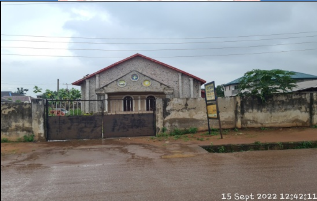
NAME: ST PETER'S CATHOLIC CHURCH ADDRESS: AGBOWA IKOSI, EPE DEFECTS: NIL