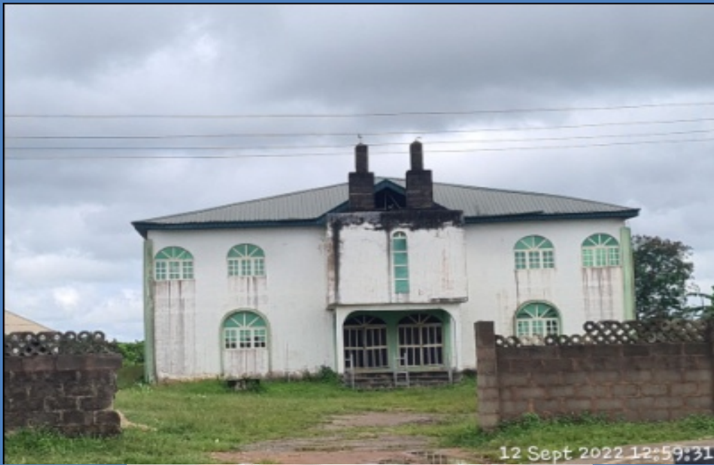
NAME: ODORAGUNSHIN CENTRAL MOSQUE ADDRESS: ALONG IJEBU ODE ROAD, ODORAGUNSHIN, EREDO LCDA, EPE DEFECTS: NIL