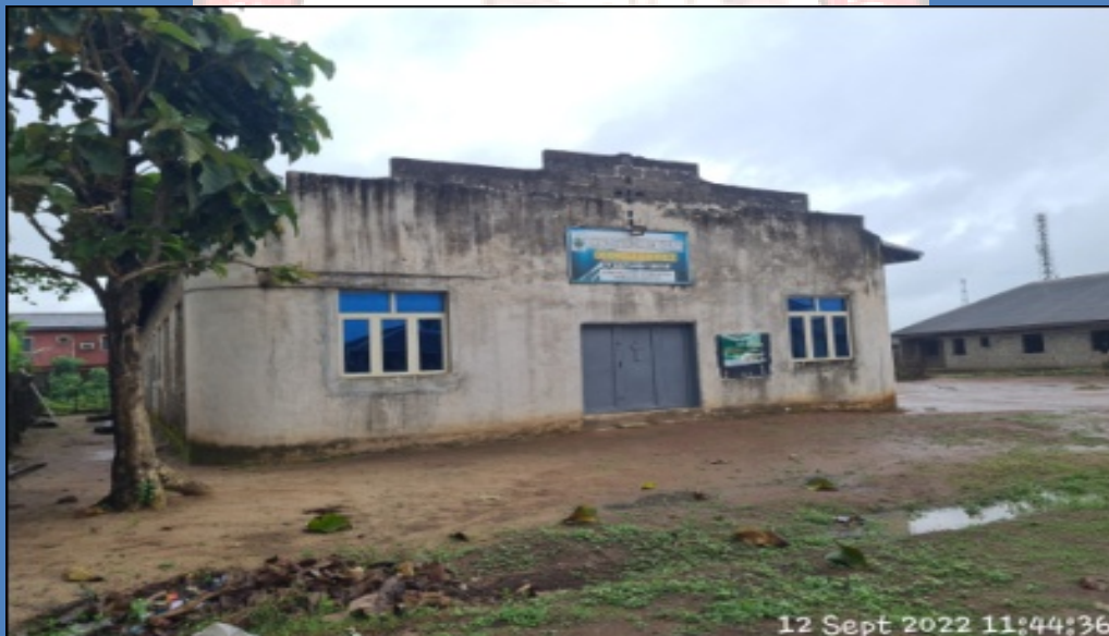
NAME: THE APOSTOLIC CHURCH OF NIGERIA (ODOMOLA DISTRICT) ADDRESS: OLUWALONILE STREET, OFF WASTAB ROAD, ODOMOLA, EPE DEFECTS: DAMPNESS NOTICED