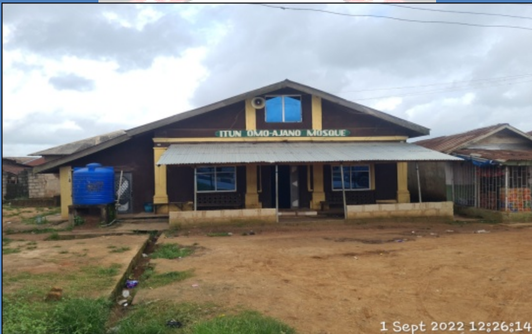
NAME: ITUN OMO-AJANO MOSQUE ADDRESS: ALONG EPE IJEBU-ODE ROAD, NOFORIJA, EPE DEFECTS: NIL