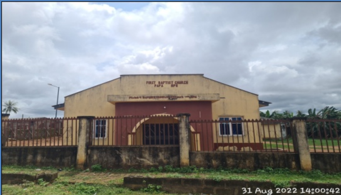
NAME: FIRST BAPTIST CHURCH ADDRESS: ALONG BAPTIST MISSION STREET, PAPA, EPE DEFECTS: NIL