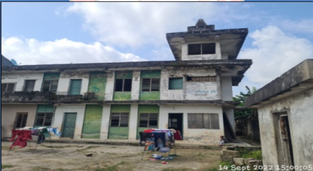
NAME: TEMIDAYO ATUNRASE MOSQUE ADDRESS: WITHIN AGBALA SOLOMON, OFF BAKARE STREET, EPE DEFECTS: SPALLING OF CONCRETE, EXPOSED REINFORCEMENT AND DAMPNES