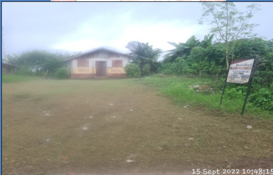
NAME: LIVING FAITH CHURCH (WINNER'S CHAPEL INTL) ADDRESS: KETU, EPE DEFECTS: NIL