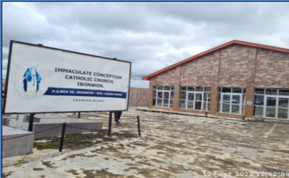
NAME: IMMACULATE CONCEPTION CATHOLIC CHURCH ADDRESS: P.O.BOX 29, IBONWON, EPE DEFECTS: NIL