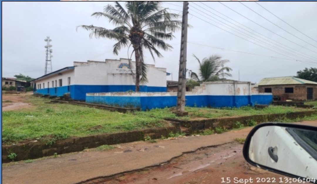
NAME: CELESTIAL CHURCH OF CHRIST ADDRESS: 10, MODU STREET, OWU-AGBOWA IKOSI, EPE DEFECTS: NIL