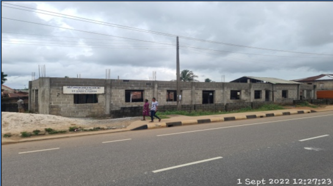
NAME: FIRST AFRICAN CHURCH MISSION (ST. DAVID'S PARISH) ADDRESS: ALONG EPE IJEBU ODE ROAD, NOFORIJA, EPE DEFECTS: NIL