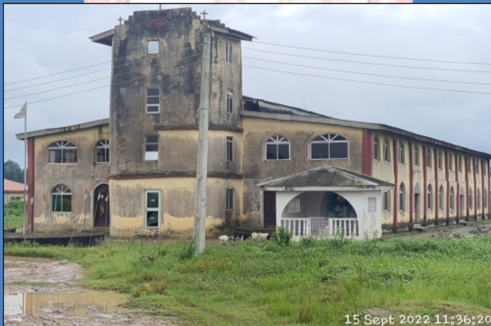
NAME: ASSEMBLY OF CHAMPIONS GOSPEL CHURCH INTERNATIONAL ADDRESS: ERERUFU, AGBOWA, IKOSI EJIRIN LCDA, EPE DEFECTS: BUILT WITH SHANTIES (TEMPORARY STRUCTURE)