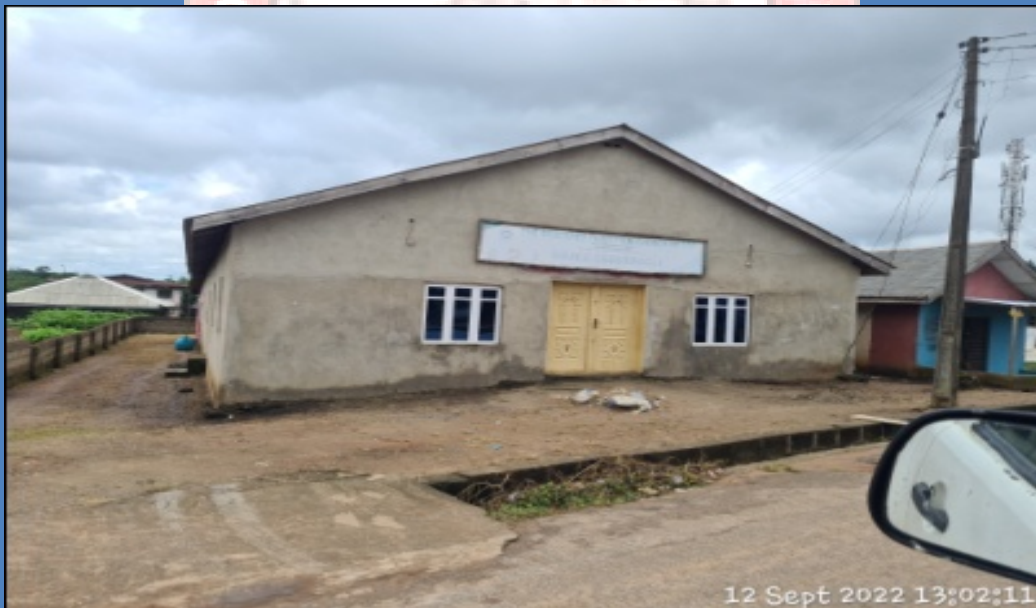
NAME: THE REDEEMED CHRISTAIN CHURCH OF GOD ADDRESS: 15, MICHEAL OTEDOLA AVENUE, ODORAGUNSHIN, EREDO LCDA, EPE DEFECTS: DAMPNES NOTICED