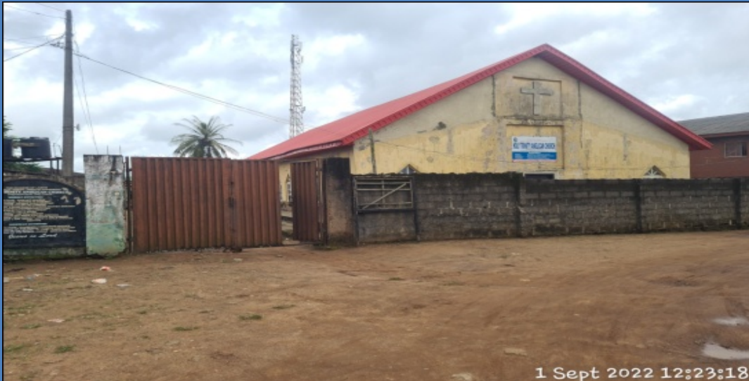
NAME: HOLY TRINITY ANGLICAN CHURCH ADDRESS: ALONG EPE IJEBU ODE ROAD, ODOMOLA, EPE DEFECTS: DAMPNESS NOTICED