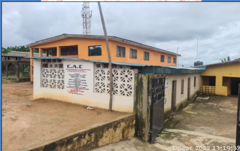
NAME: C.A.C MOUNTAIN OF HELP AND RESTORATION (OKE IRAWO ATI ATUNSE) ADDRESS: EPE-IJEBU ODE ROAD, EREDO, EPE DEFECTS: BUILT ON THE FENCE