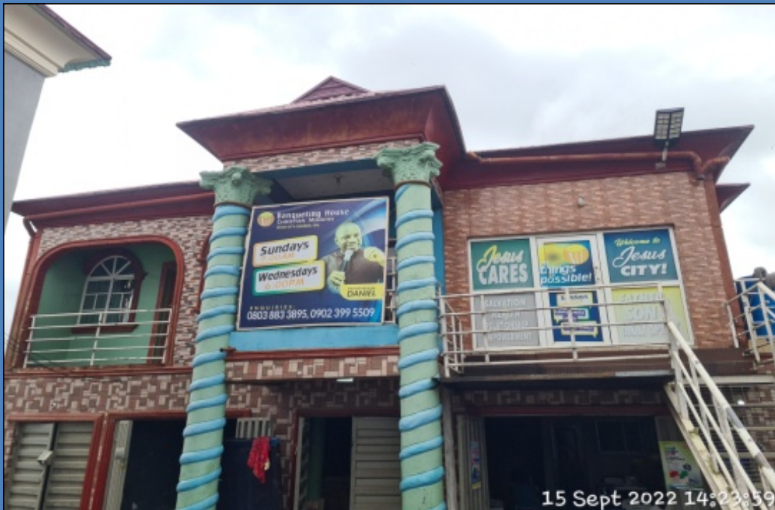
NAME: BANQUETING HOUSE CHRISTAIN MINISTRY (JESUS CITY CHURCH) ADDRESS: LORD ROAD, CELE BUS STOP, EPE DEFECTS: NIL