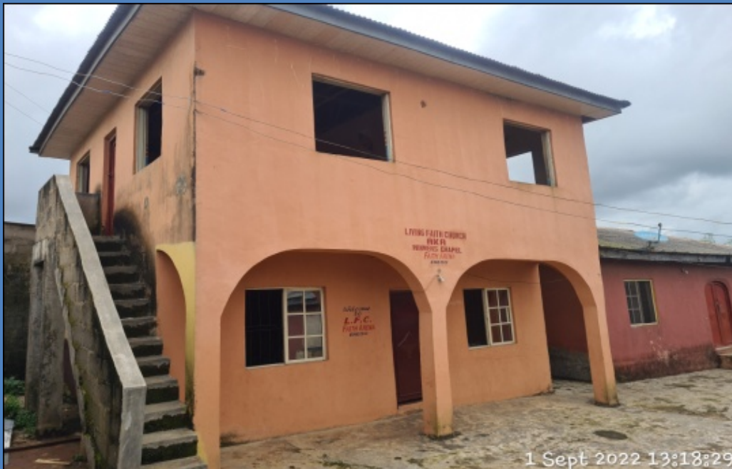
NAME: LIVING FAITH CHURCH (WINNER'S CHAPEL) ADDRESS: 51, EPE IJEBU ODE ROAD, EREDO, EPE DEFECTS: NIL