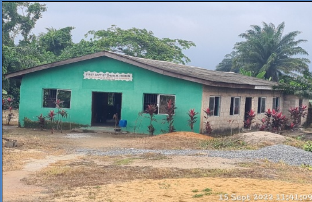
NAME: FIRST BAPTIST CHURCH (SANCTUARY OF TRUTH AND LIBERTY) ADDRESS: EPE ITOKIN ROAD, EPE DEFECTS: NIL