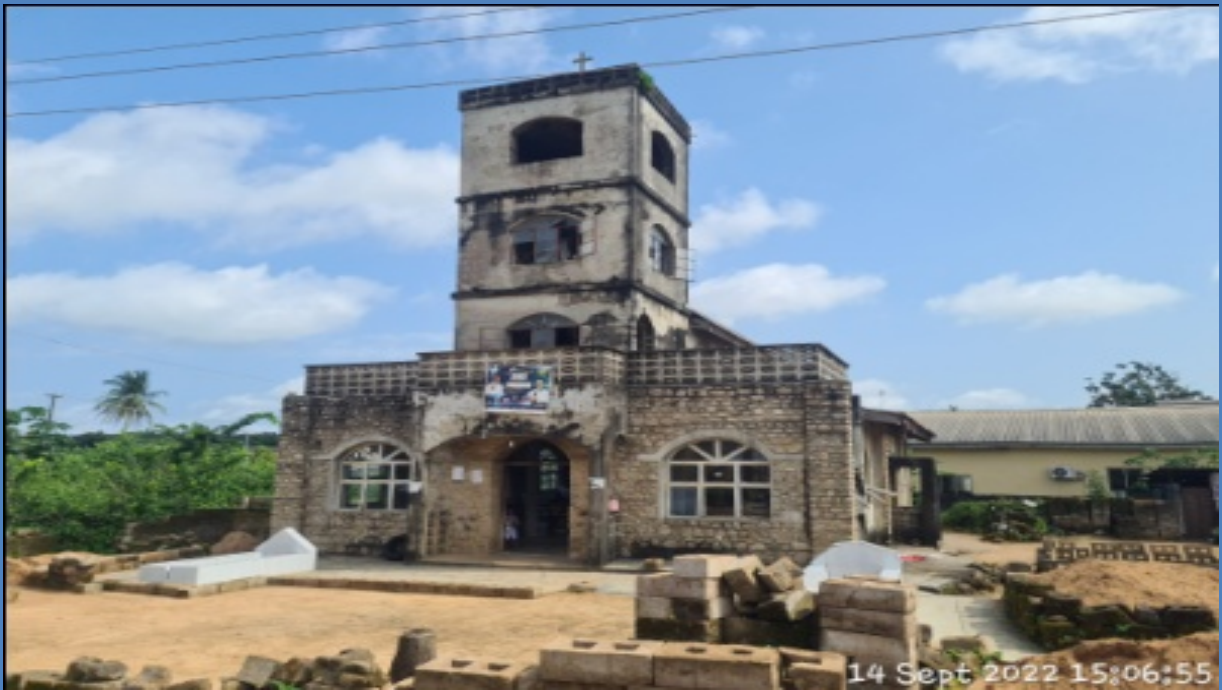
NAME: CHERUBIM AND SERAPHIM CHURCH ADDRESS: AGBALA STREET, OFF BAKARE STREET, EPE DEFECTS: DAMPNES NOTICED