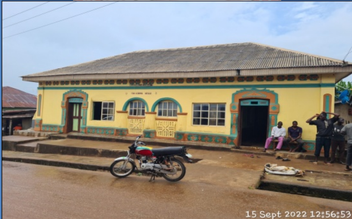
NAME: ITUN AGBOWA MOSQUE ADDRESS: LATEEF JAKANDE ROAD, AGBOWA, EPE DEFECTS: NIL