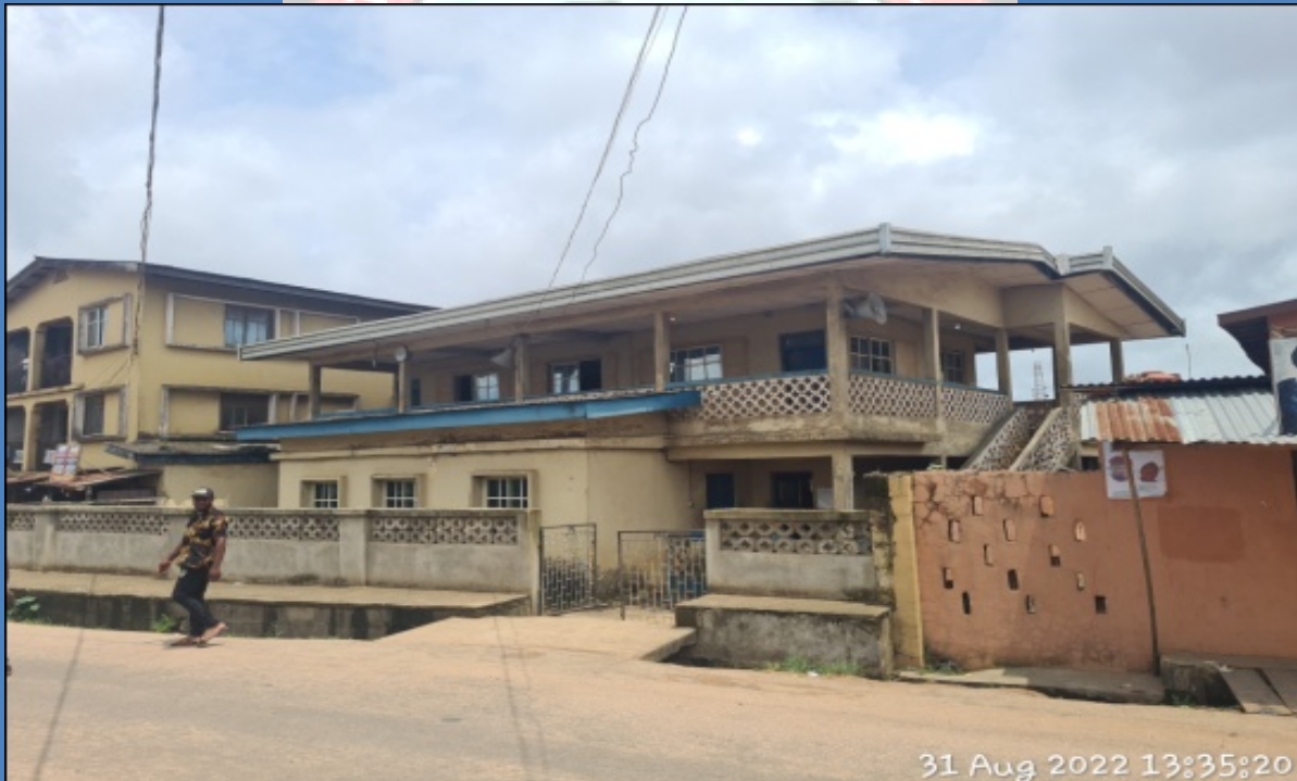
NAME: AREPO RATIBI MOSQUE ADDRESS: ALONG CENTRAL MOSQUE ROAD, JAGBOJAGBO, EPE DEFECTS: NIL