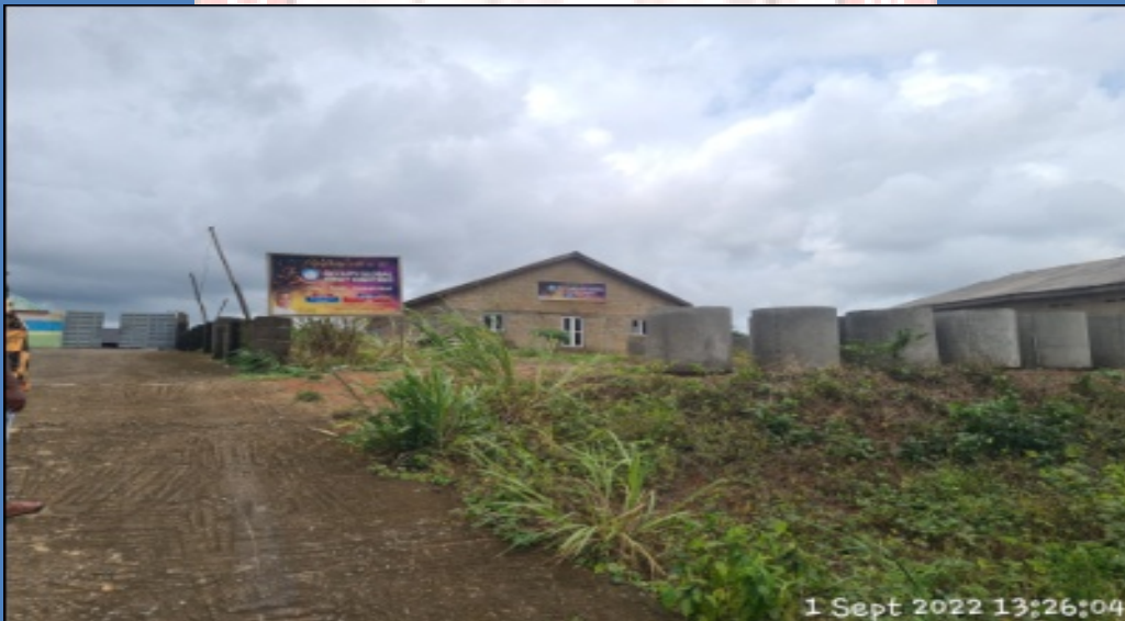
NAME: OCCUPY GLOBAL IMPACT MINISTRIES ADDRESS: KM12, EPE IJEBU ODE ROAD, BESIDES UNIVERSAL PAINT, ODOSHIWOLA, EPE DEFECTS: NIL