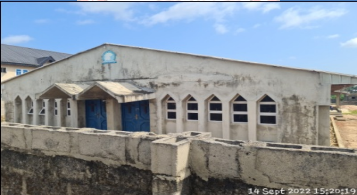
NAME: DEEPER LIFE BIBLE CHURCH (LAGOS DISTRICT) ADDRESS: OFF OWU ALADE STREET, EPE DEFECTS: NIL