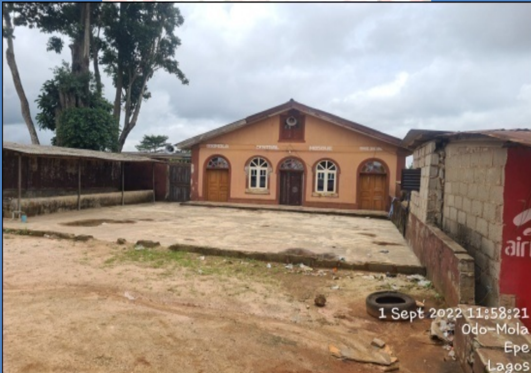
NAME: ODOMOLA CENTRAL MOSQUE ADDRESS: ALONG EPE IJEBU-ODE ROAD, ODOMOLA, EPE DEFECTS: NIL