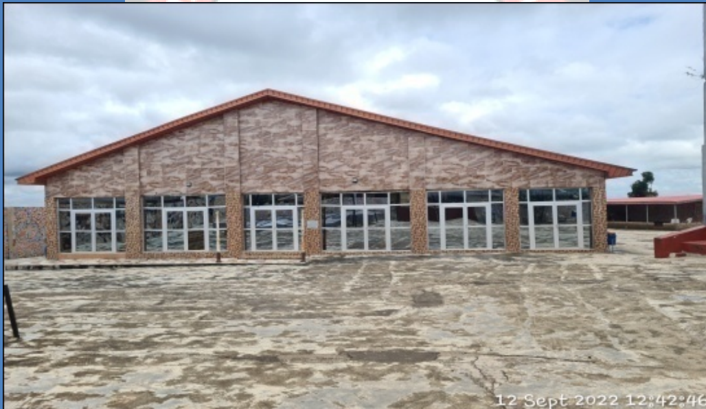
NAME: CATHOLIC CHURCH ADDRESS: ALONG AJEGUNLE ROAD, IGBOYE ROAD, IBONWON, EPE DEFECTS: NIL