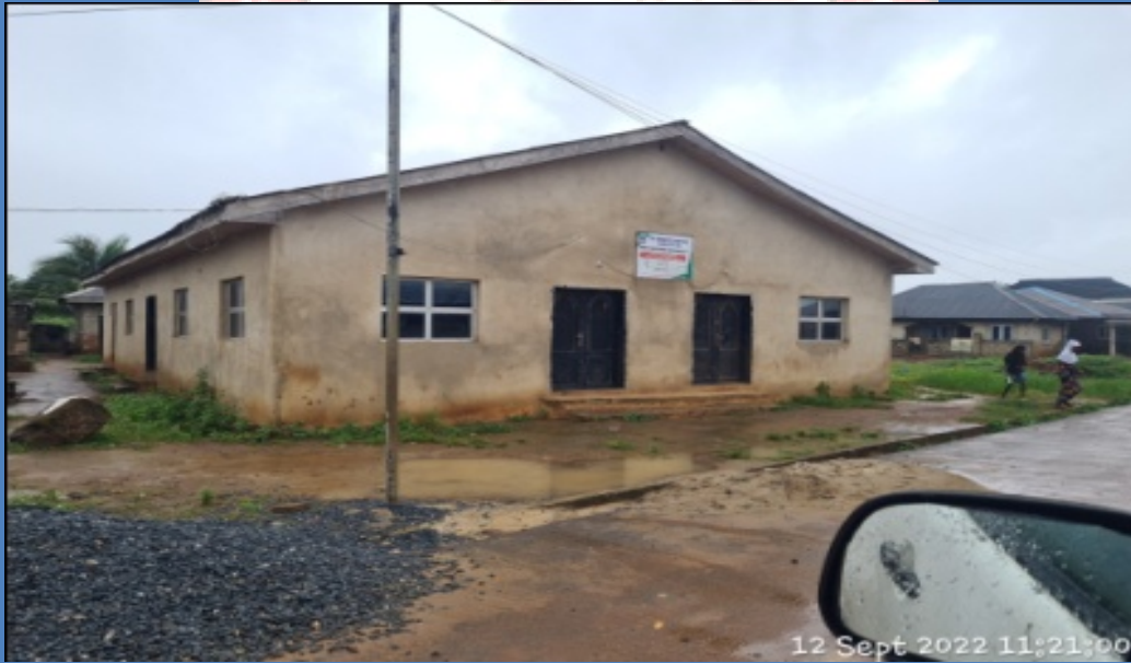
NAME: THE REDEEMED CHRISTAIN CHURCH OF GOD ADDRESS: ADEKUNLE TOBUN STREET, OFF IRAYE ROAD, EPE DEFECTS: DAMPNES NOTICED