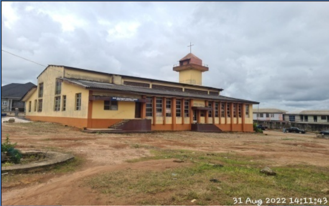
NAME: REVD BRAITHWAITE MEMORIAL CHURCH ADDRESS: ALONG REVD BRAITHWAITE STREET, PAPA, EPE DEFECTS: NIL