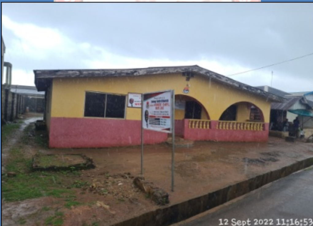
NAME: LIVING FAITH CHURCH ADDRESS: 9, ADEKUNLE TOBUN STREET BY BAALE BUS STOP, EPE DEFECTS: NIL