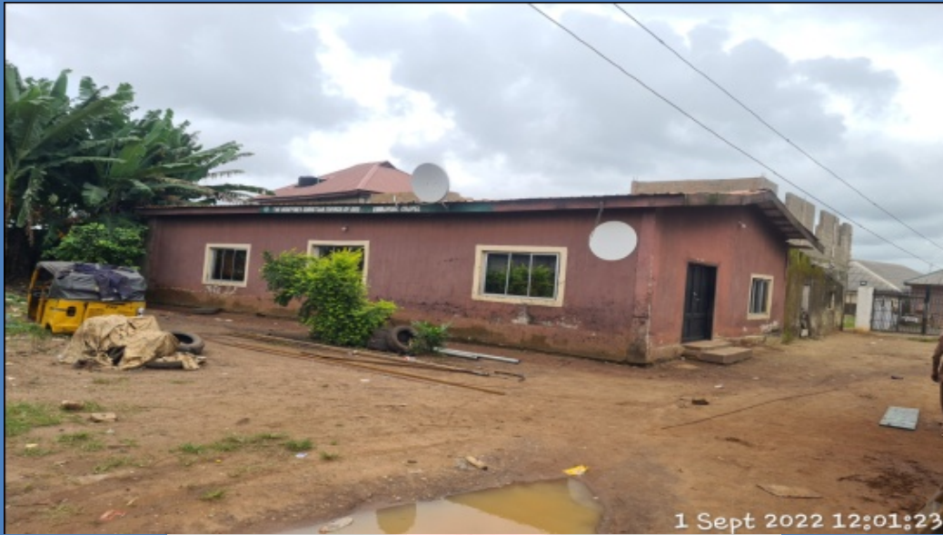
NAME: THE REDEEMED CHRISTAIN CHURCH OF GOD (EMMANUEL CHAPEL) ADDRESS: ALONG EPE IJEBU ODE ROAD, ODOMOLA, EPE DEFECTS: DAMPNES NOTICED