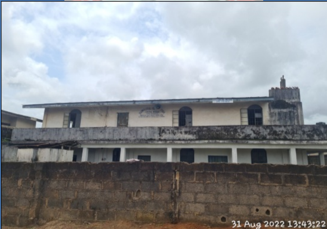
NAME: ZUMRATUL ISLAMIYYAH CENTRAL MOSQUE ADDRESS: ALONG ADEYEMI APENA STREET, EPE DEFECTS: ABANDONED