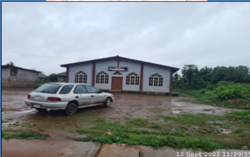
NAME: THE FIRST AFRICAN CHURCH MISSION (ST. PAUL'S CHURCH) ADDRESS: IRAYE ROAD, IRAYE OKE, EPE DEFECTS: NIL