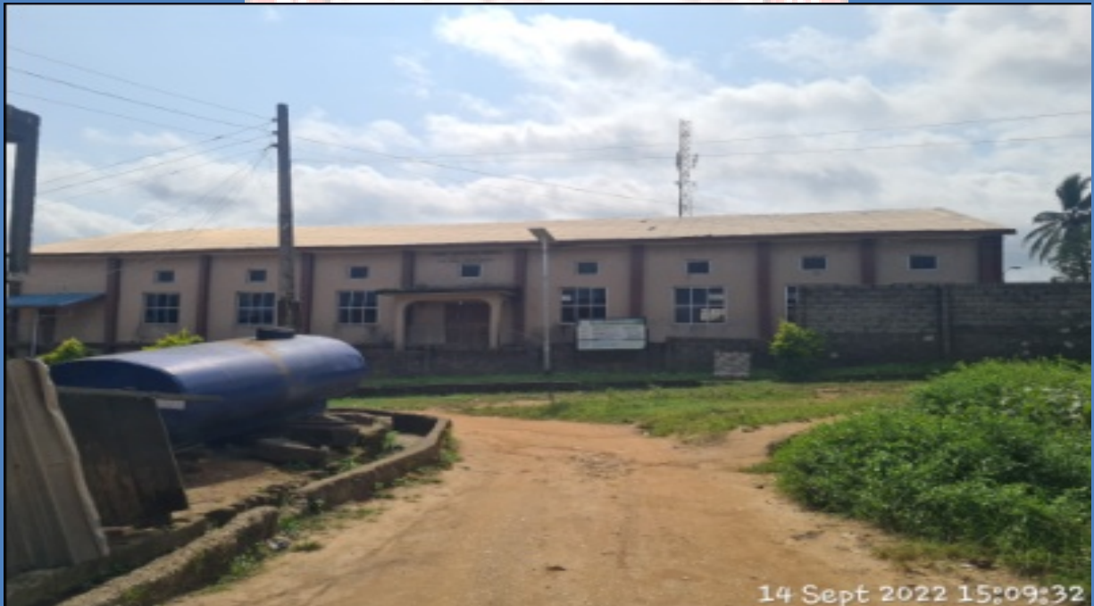
NAME: CHRIST APOSTOLIC CHURCH (OKE IBUKUN) EPE ZONAL HEADQUARTERS ADDRESS: AGBALA, OFF BAKARE STREET, EPE DEFECTS: NIL