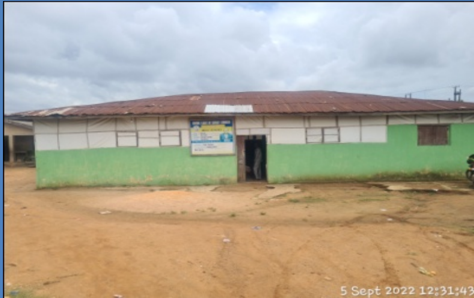
NAME: CHRIST THE KING CATHOLIC CHURCH ADDRESS: ALONG LAGOS ROAD, BESIDE SEGSON MINI MART, CELE, EPE DEFECTS: DAMPNES NOTICED