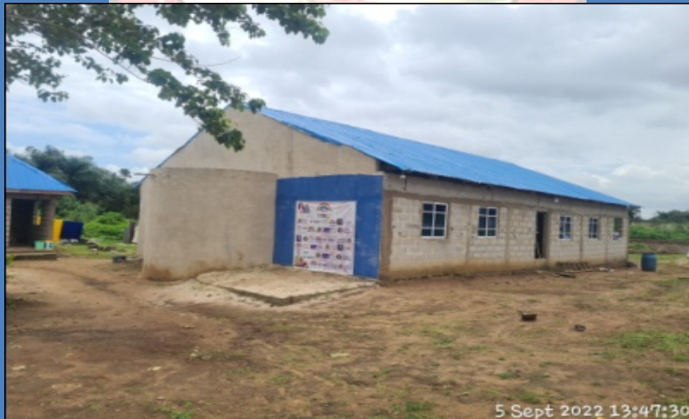
NAME: CELESTIAL CHURCH OF CHRIST ADDRESS: ALONG SHALDAG ROAD, OFF EPE ITOKIN ROAD, TEMU, EPE DEFECTS: NIL