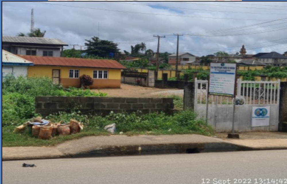
NAME: PRESBYTERIAN CHURCH OF NIGERIA ADDRESS: BESIDE T-TAB PETROL FILLING STATION, AIYETORO ROAD, ITAMARUN, EPE DEFECTS: NIL