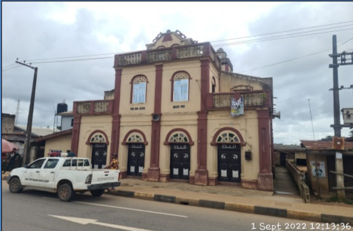
NAME: POBO AREA CENTRAL MOSQUE ADDRESS: ALONG EPE IJEBU-ODE ROAD, ODOMOLA, EPE DEFECTS: NIL