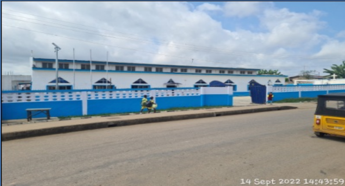
NAME: CELESTIAL CHURCH OF CHRIST (OSHOFFA) ADDRESS: KASALI OLUWO STREET, PAPA, EPE DEFECTS: NIL