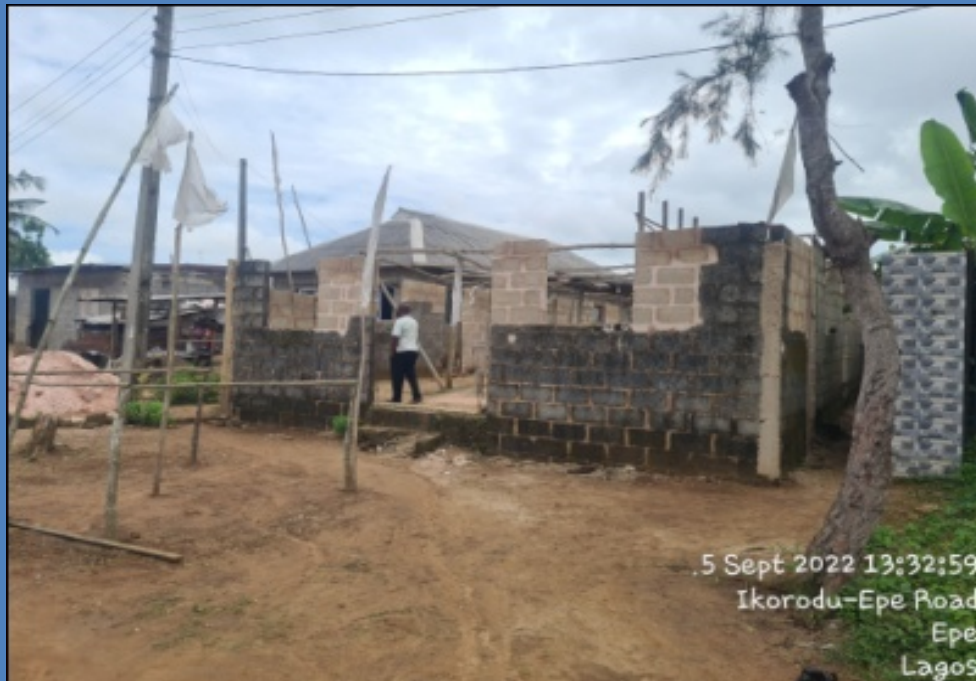
NAME: HEALING GOSPEL MIRACLE CHURCH OF ZION MINISTRIES ADDRESS: ALONG EPE ITOKIN ROAD, TEMU, EPE DEFECTS: DAMPNES ON THE WALL