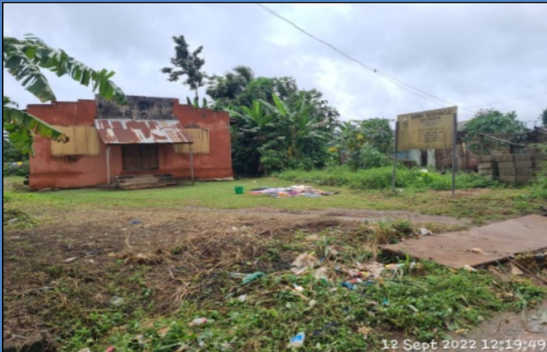
NAME: DIVINE TABERNACLE GOSPEL MISSION INC. ADDRESS: ILARA TOWN, ILARA, EPE DEFECTS: NIL