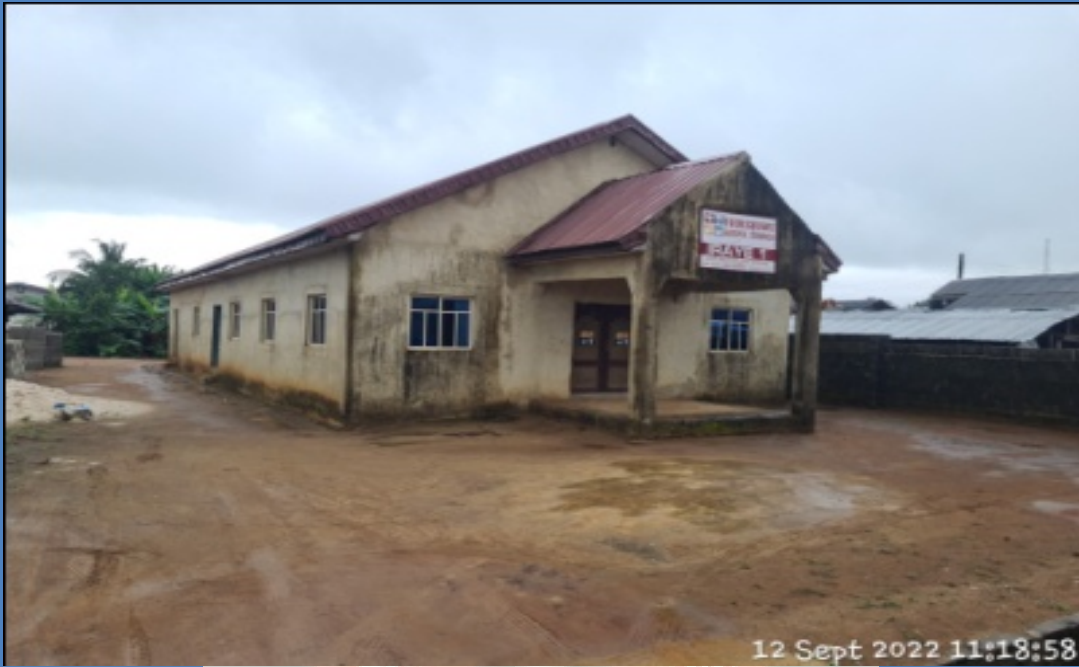
NAME: FOURSQUARE GOSPEL CHURCH ADDRESS: ADEKUNLE TOBUN STREET, OFF IRAYE ROAD, EPE DEFECTS: DAMPNES NOTICED