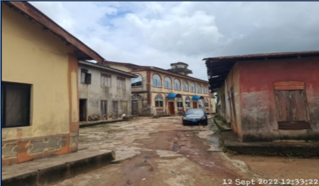
NAME: OKE-MAGBA CENTRAL MOSQUE/IBOWON CENTRAL MOSQUE ADDRESS: ALONG IGBOYE ROAD, IGBOYE, EPE DEFECTS: DAMPNES IN ONE OF THE STRUCTURES