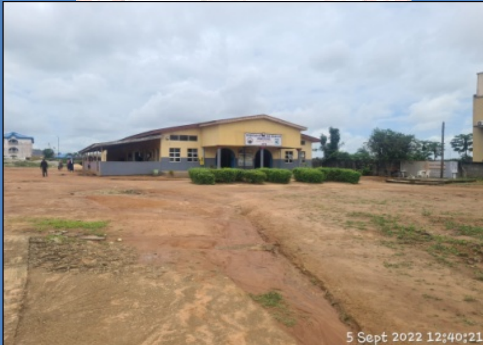
NAME: MOUNTAIN OF FIRE AND MIRACLES MINISTRIES ADDRESS: ALONG LAGOS ROAD, EPE DEFECTS: NIL