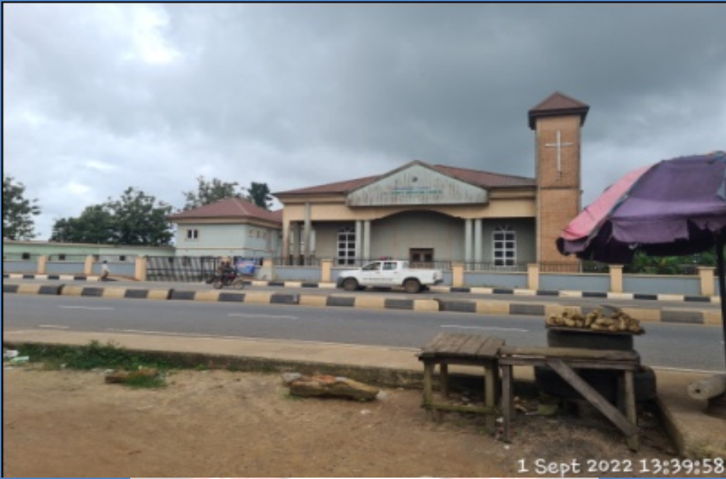
NAME: ALL SAINTS ANGLICAN CHURCH ADDRESS: EPE IJEBU ODE ROAD, OKE MAGBA, MAJODA, EREDO, EPE DEFECTS: NIL