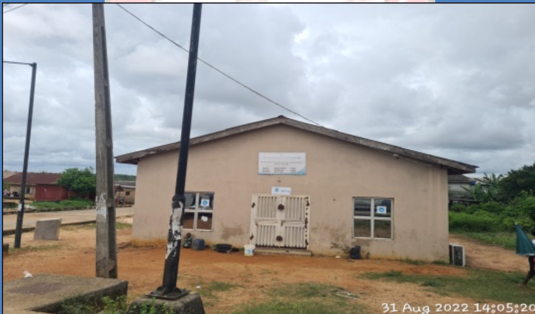
NAME: THE REDEEMED CHRISTAIN CHURCH OF GOD ADDRESS: 64, EKUNDAYO STREET, OPPOSITE OGUNMODEDE COLLEGE, PAPA, EPE DEFECTS: NIL