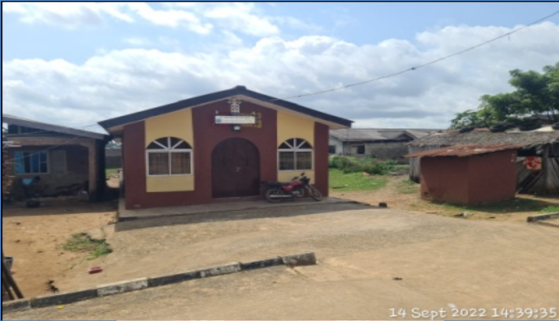
NAME: THE TRANSFORMED CHRISTAIN ASSEMBLY INC ADDRESS: KASALI OLUWO STREET, PAPA, EPE DEFECTS: NIL