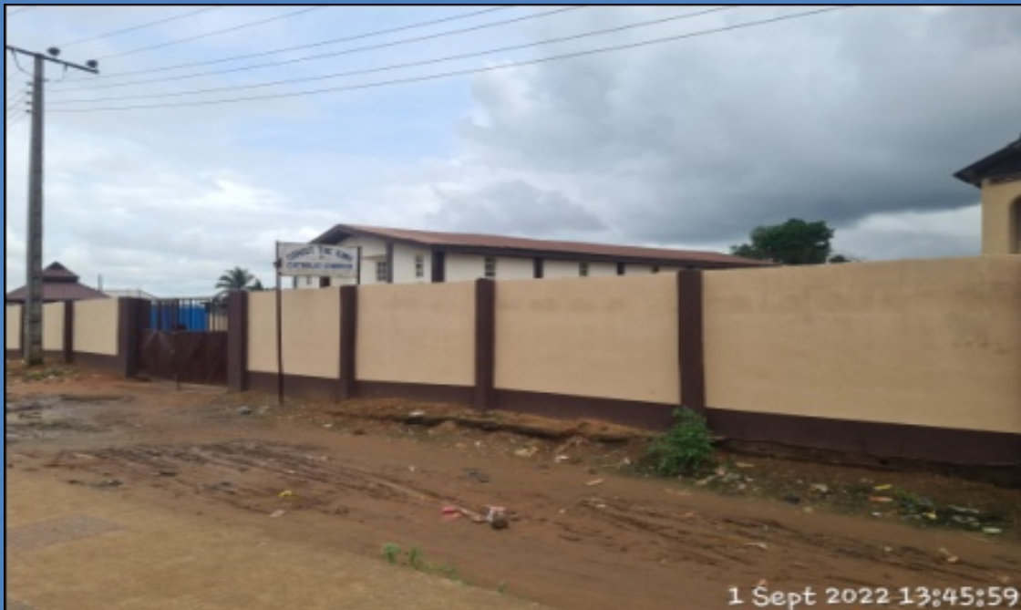
NAME: CHRIST THE KING CATHOLIC CHURCH ADDRESS: EPE IJEBU ODE ROAD, MAJODA, EREDO, EPE DEFECTS: NIL