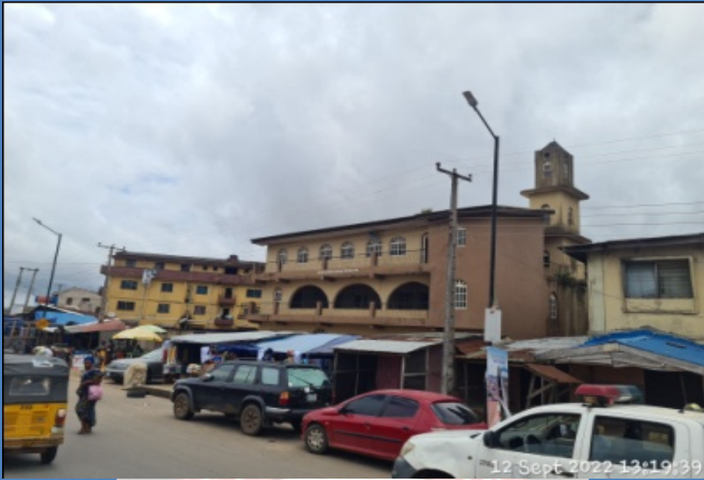
NAME: ANWAR-UL-ISLAM CENTRAL MOSQUE ADDRESS: AIYETORO ROAD, EPE DEFECTS: NIL