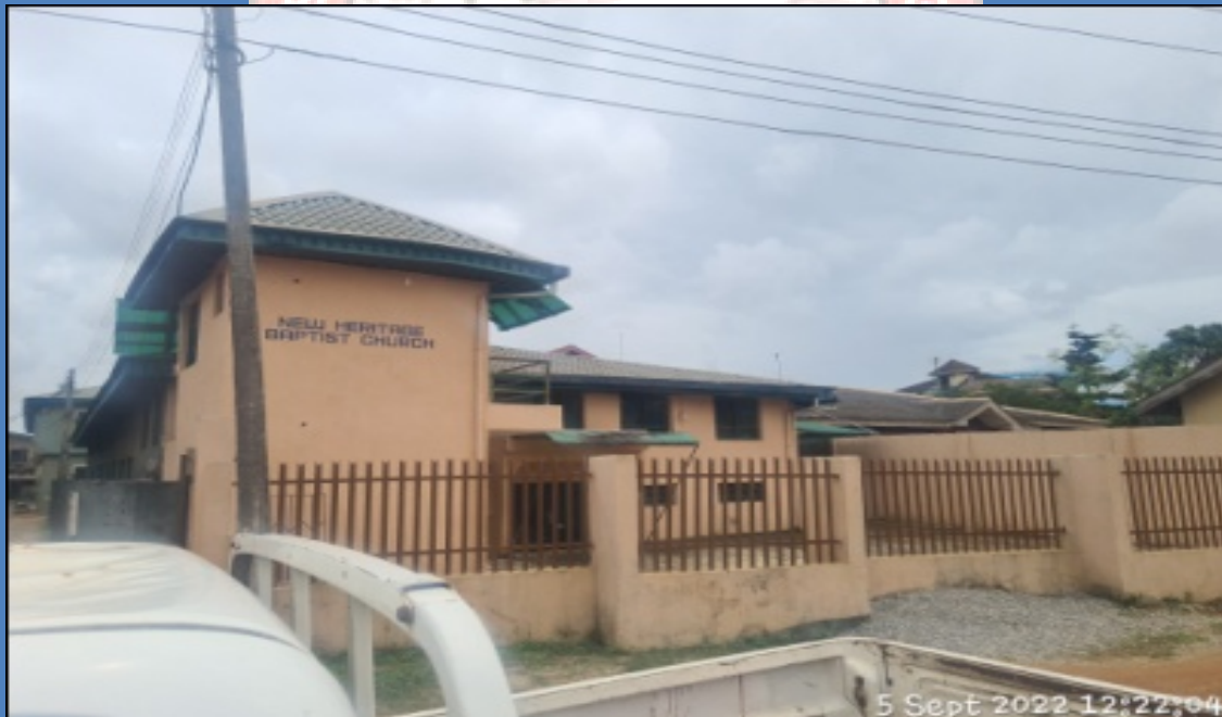
NAME: NEW HERITAGE BAPTIST CHURCH ADDRESS: ALONG LAGOS ROAD, EPE DEFECTS: NIL