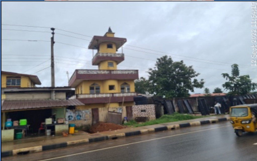
NAME: OLORUNLOGBON RATIBI MOSQUE ADDRESS: ALONG IJEBU ODE ROAD, POKA, EPE DEFECTS: NIL