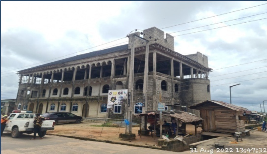
NAME: ZUMRATUL ISLAMIYYAH CENTRAL MOSQUE ADDRESS: ALONG ADEYEMI APENA STREET, EPE DEFECTS: NIL