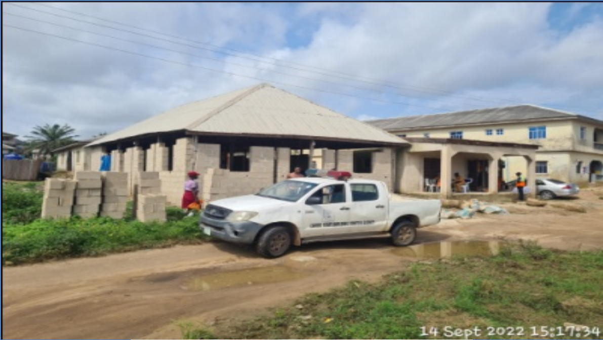
NAME: COVENANT CHURCH OF GOD ADDRESS: 3, OWU ALADE STREET, EPE DEFECTS: NIL