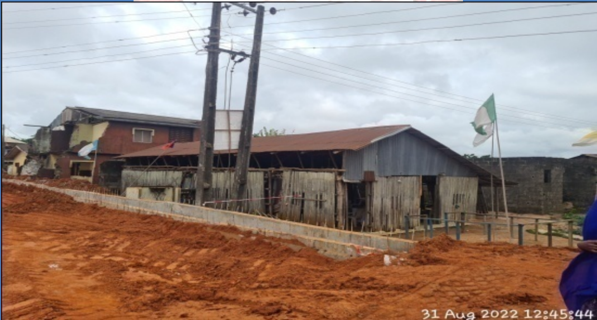
NAME: UNKNOWN CHURCH ADDRESS: ALONG AWOLOWO ROAD BY ARAROMI JUNCTION DEFECTS: MADE OF SHANTIES, BUILT ON ROAD SETBACKS AND CLOSE TO PHCN TRANSFORMER