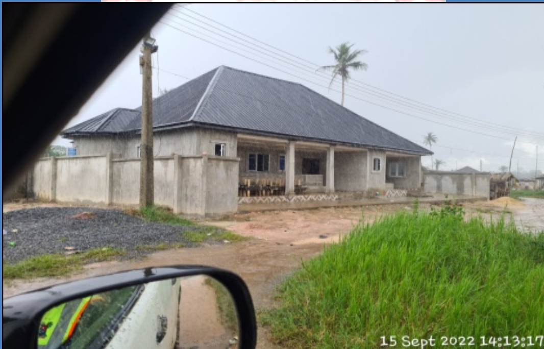
NAME: EXISTING MOSQUE ADDRESS: SALA TOWN, IKOSI EJIRIN LCDA, EPE DEFECTS: NIL