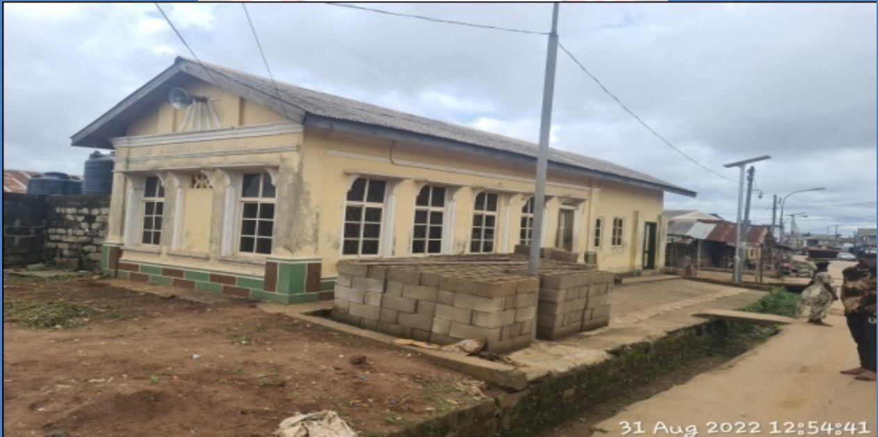
NAME: ADINNI RATIBI MOSQUE ADDRESS: ALONG CENTRAL MOSQUE ROAD, OKE BALOGUN, EPE DEFECTS: NIL