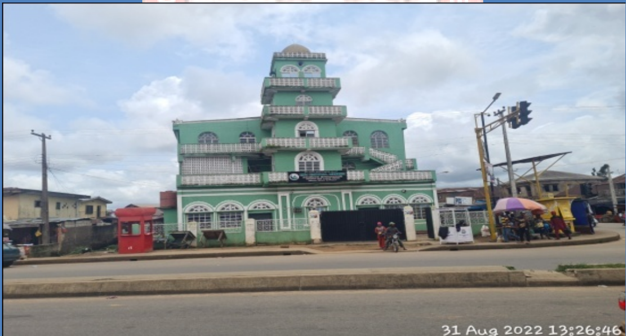
NAME: FIRST EPE CENTRAL MOSQUE ADDRESS: ALONG CENTRAL MOSQUE ROAD, OKE BALOGUN, EPE DEFECTS: NIL