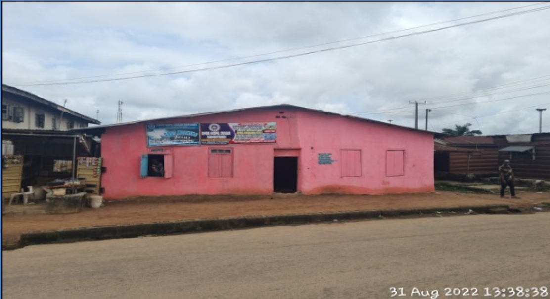
NAME: DIVINE GOSPEL CRUSADE MINISTRY ADDRESS: ALONG CENTRAL MOSQUE ROAD, JAGBOJAGBO, EPE DEFECTS: NIL