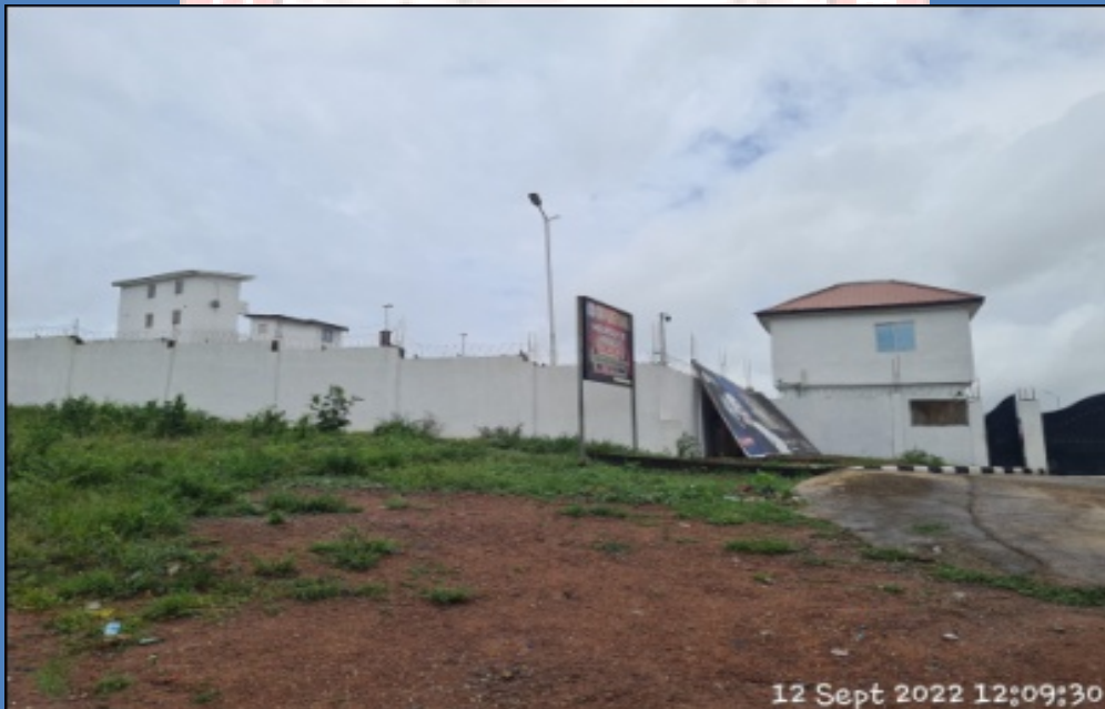
NAME: ORI OKE IYANU (MOUNTAIN OF MIRACLE) ADDRESS: OPPOSITE ST. AGUSTINE SCHOOL, ILARA ROAD, EPE DEFECTS: NIL