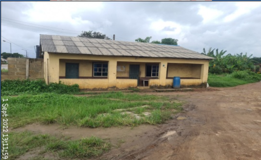
NAME: EREDO CENTRAL MOSQUE ADDRESS: ALONG EPE IJEBU-ODE ROAD, EREDO, EPE DEFECTS: VISIBLE CRACKS ALONG THE WALL WITH DAMPNES