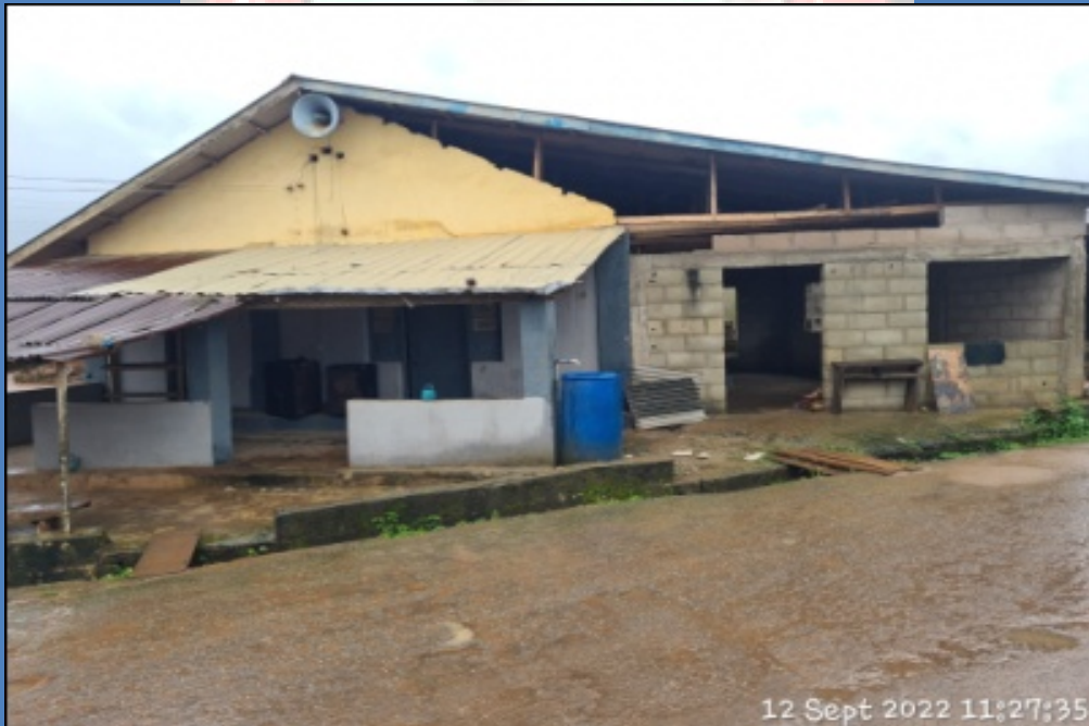
NAME: CENTRAL MOSQUE ADDRESS: ALONG ORIWU STREET, OFF IRAYE ROAD, IRAYE OKE, EPE DEFECTS: NIL