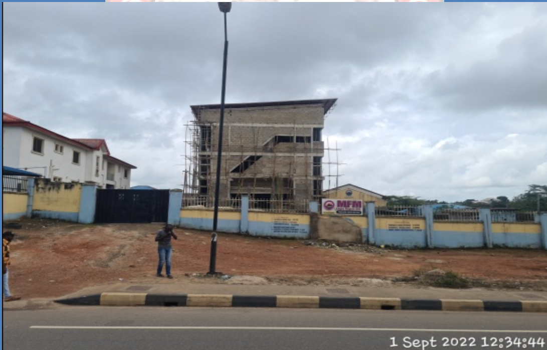
NAME: MOUNTAIN OF FIRE MIRACLES MINISTRY (LAGOS REGION 210) ADDRESS: ALONG EPE IJEBU ODE ROAD, NOFORIJA, OPPOSITE MICHEAL OTEDOLA COLLEGE, EPE DEFECTS: NIL