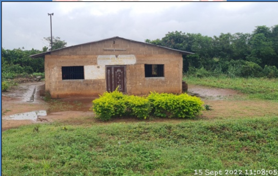
NAME: ASSEMBLIES OF GOD CHURCH ADDRESS: EPE ITOKIN ROAD, KETU, EPE DEFECTS: NIL