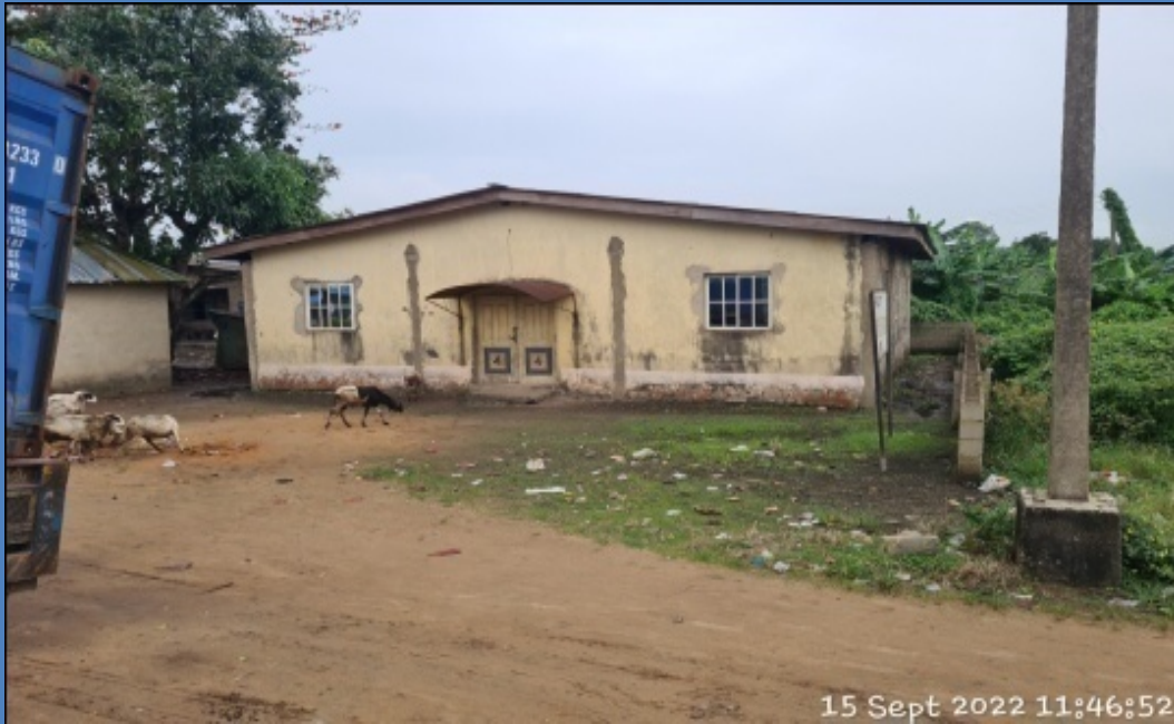
NAME: FOURSQUARE GOSPEL CHURCH ADDRESS: ITOKIN, IKOSI EJIRIN LCDA, EPE DEFECTS: DAMPNES NOTICED