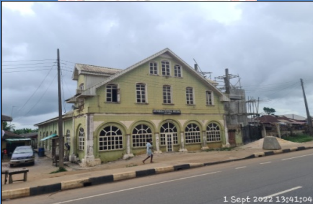
NAME: OKE MAGBA CENTRAL MOSQUE ADDRESS: EPE IJEBU-ODE ROAD, OKE MAGBA, MOJODA, EREDO, EPE DEFECTS: NIL