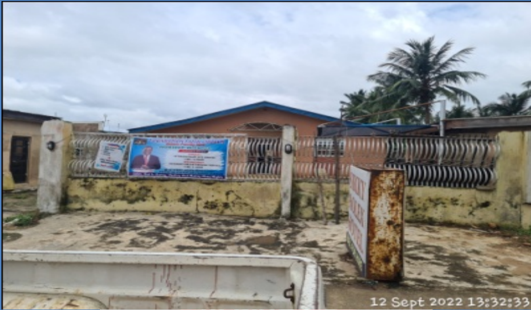
NAME: FOUNDATION FAITH CHURCH (SALEM FAMILY) ADDRESS: LAGOS ROAD, EPE DEFECTS: DAMPNESS ON THE FENCE WALL