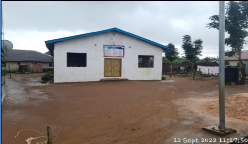
NAME: CHEERUBIM AND SERAPHIM MOVEMENT CHURCH ADDRESS: ADEKUNLE TOBUN STREET, OFF IRAYE ROAD, EPE DEFECTS: NIL