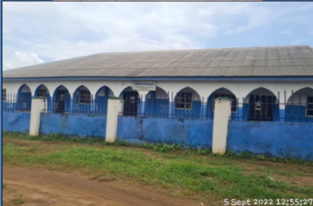
NAME: SHAMSUL HUDA SOCIETY OF NIGERIA CENTRAL MOSQUE ADDRESS: IJAKO, TEMU, EPE DEFECTS: NIL