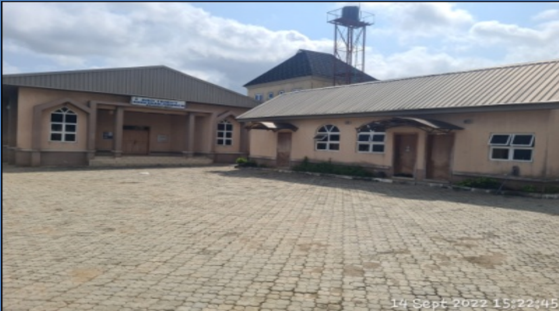
NAME: HOLY TRINITY ANGLICAN CHURCH ADDRESS: ERASCO, OFF LAGOS ROAD, EPE DEFECTS: NIL