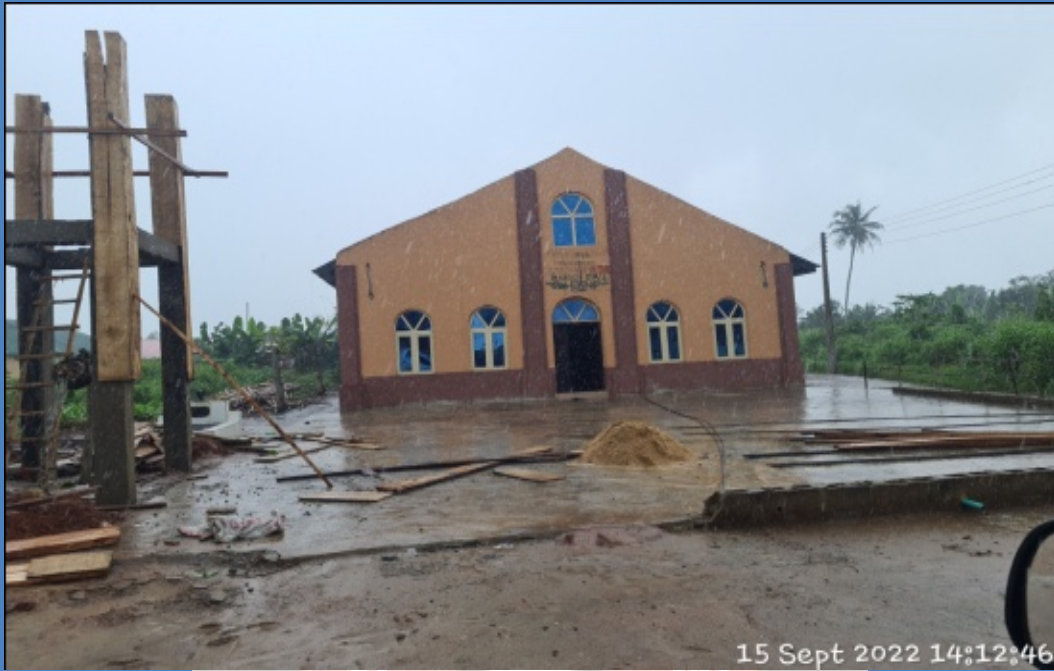
NAME: ST JOHN'S ANGLICAN CHURCH ADDRESS: SALA TOWN, IKOSI EJIRIN LCDA, EPE DEFECTS: NIL