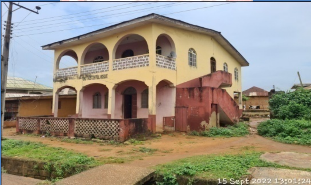
NAME: OWU IKOSI CENTRAL MOSQUE ADDRESS: LATEEF JAKANDE ROAD, AGBOWA, EPE DEFECTS: NIL