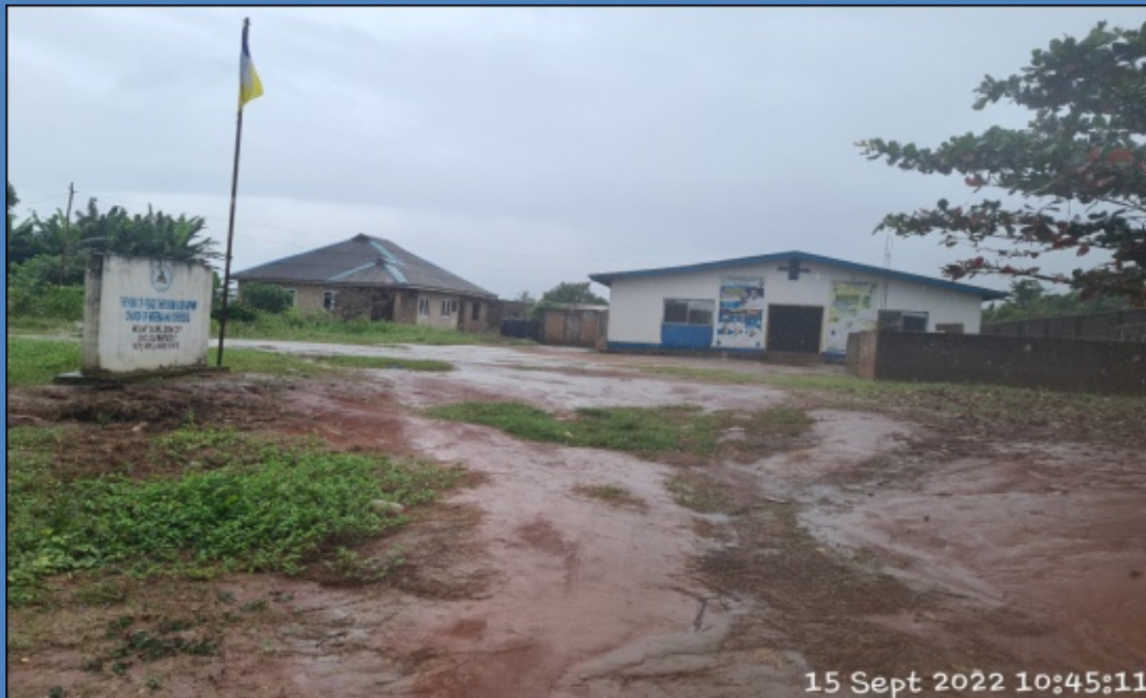
NAME: THE KING OF PEACE CHERUBIM & SERAPHIM CHURCH OF NIGERIA AND OVERSEAS (MOUNT OLIVE ZION CITY, OGO OLUWATEDO I) ADDRESS: KETU, EPE DEFECTS: NIL