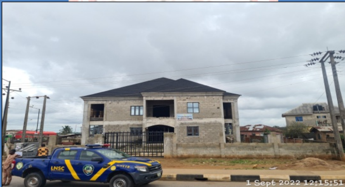
NAME: THE FIRST AFRICAN CHURCH MISSION (ST. DAVID'S PARISH) ADDRESS: ALONG EPE IJEBU ODE ROAD, ODOMOLA, EPE DEFECTS: NIL