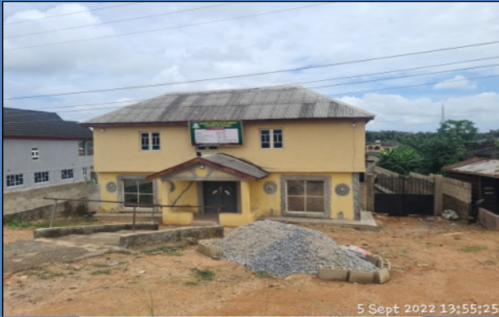
NAME: GOSPEL CHURCH OF CHRIST (CHAPEL OF PRAISE) ADDRESS: 152A ALONG LAGOS ROAD, EPE DEFECTS: NIL