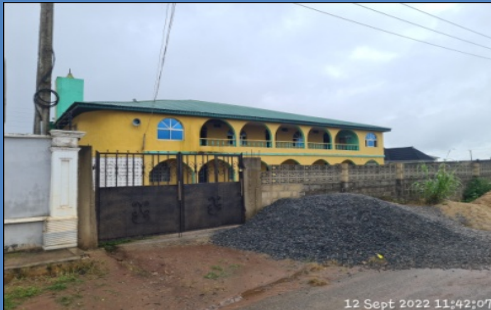
NAME: AJUMONI CENTRAL MOSQUE ADDRESS: ALONG ODO EGIRI, ODO EGIRI, EPE DEFECTS: NIL