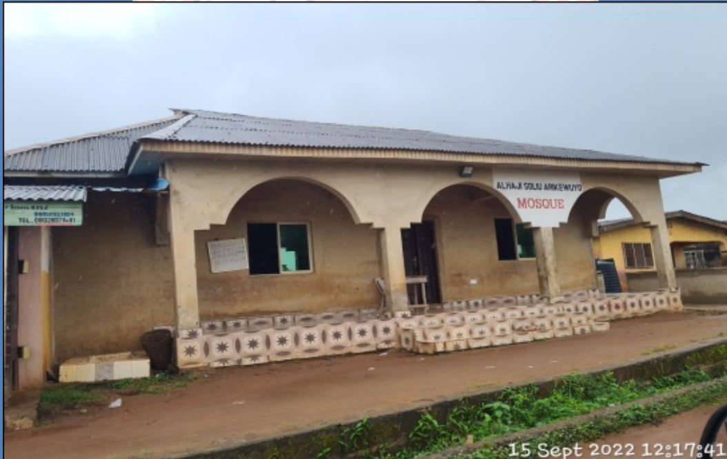
NAME: ALHAJI SOLIU ARIKEWUYO MOSQUE ADDRESS: AGBOWA IKOSI, EPE DEFECTS: NIL