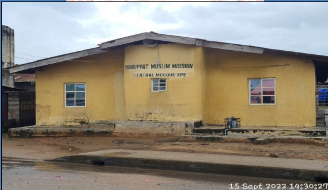
NAME: MAHDIYYAT MUSLIM MISSION CENTRAL MOSQUE ADDRESS: AIYETORO ROAD, ITA OPO, EPE DEFECTS: DAMPNES NOTICED