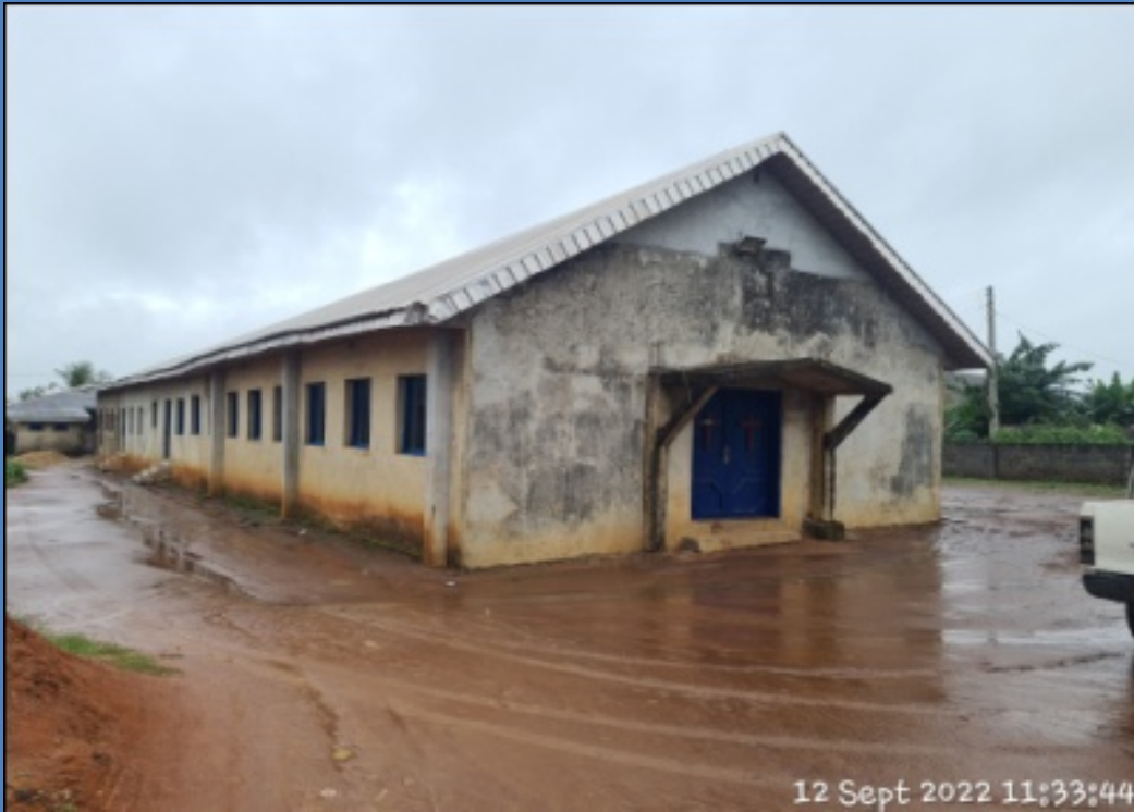
NAME: DEEPER LIFE CHRISTAIN CHURCH ADDRESS: OPPOSITE ODOMOLA SECONDARY SCHOOL, IRAYE ROAD, EPE DEFECTS: DAMPNES NOTICED