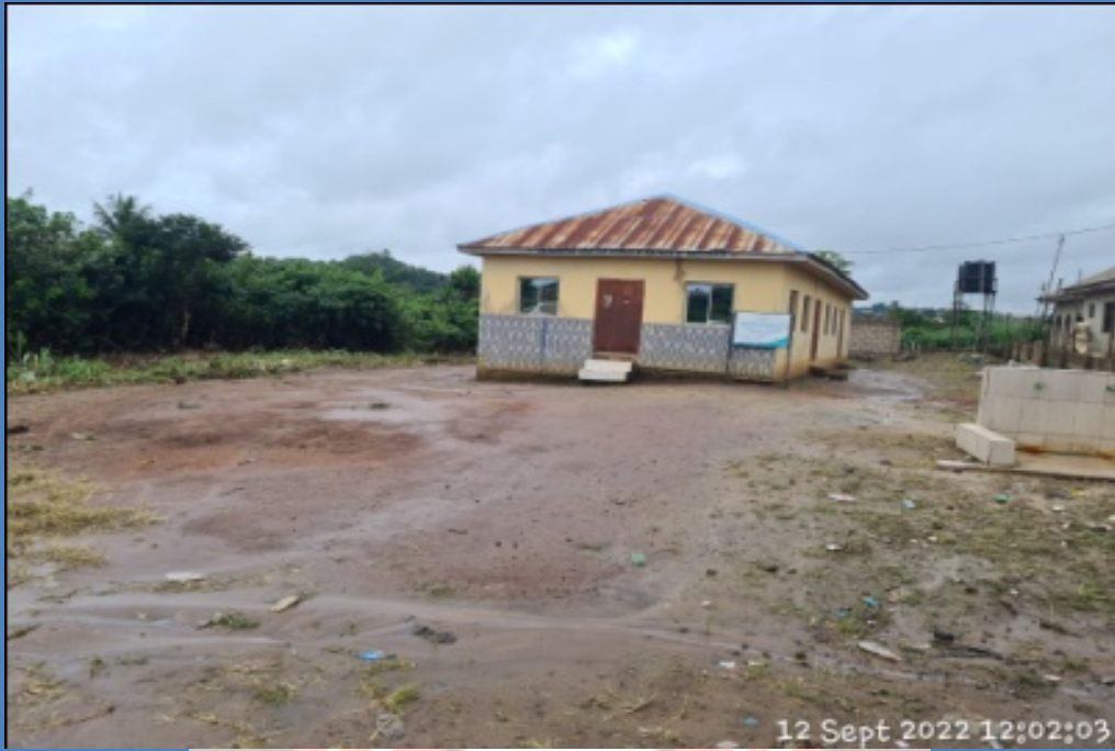
NAME: THE REDEEMED CHRISTAIN CHURCH OF GOD (ROCK OF AGES PARISH) ADDRESS: ALONG ILARA ROAD, ILARA, EPE DEFECTS: NIL