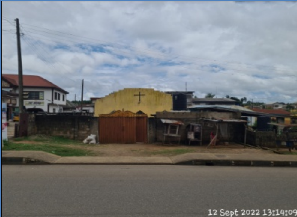
NAME: CHERUBIM AND SERAPHIM MOVEMENT CHURCH ADDRESS: BESIDE T-TAB PETROL FILLING STATION, AIYETORO ROAD, ITAMARUN, EPE DEFECTS: NIL