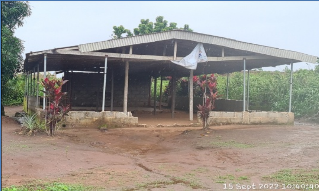
NAME: SAINT STEVEN'S CATHOLIC CHURCH ADDRESS: KETU, EPE DEFECTS: NIL