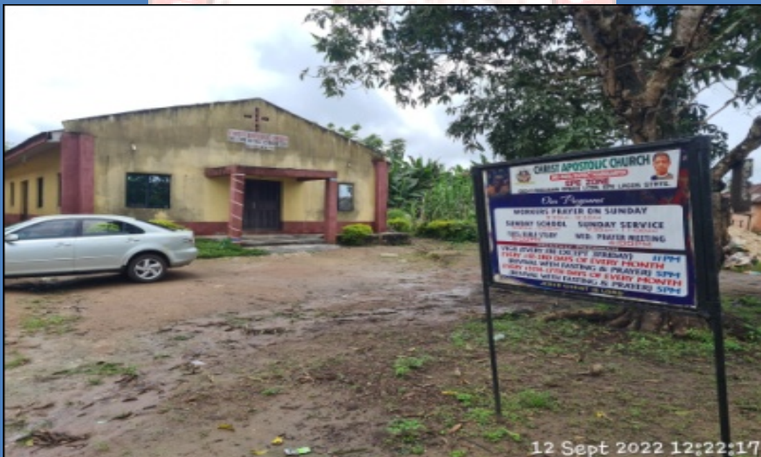
NAME: CHRIST APOSTOLIC CHURCH, OKE ITURA DISTRICT HEADQUARTERS ADDRESS: ODOYANGUNSHIN, ILARA, EPE DEFECTS: NIL