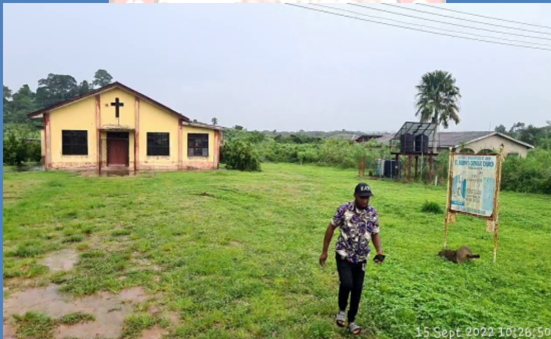
NAME: ST JOSEPH'S CATHOLIC CHURCH ADDRESS: EPE ITOKIN ROAD, MOLAJOYE, EPE DEFECTS: NIL