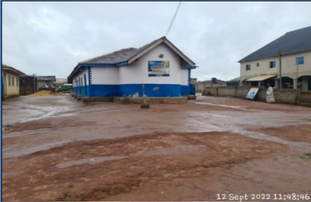
NAME: TOLUWANILE CELESTIAL CHURCH OF CHRIST ADDRESS: ALONG SABIU OLANREWAJU STREET, ODOMOLA, EPE DEFECTS: NIL