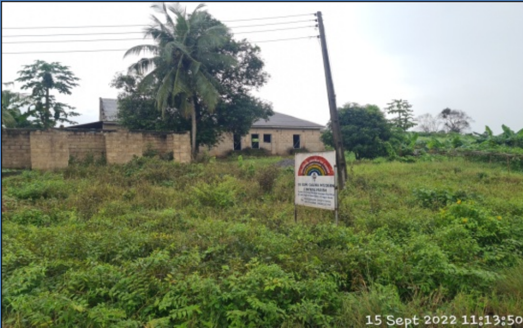
NAME: CELESTIAL CHURCH OF CHRIST (IBI-ISIMI OLUWA MODERN CENTRAL PARISH, AGBALA OLUWASHEYI MICHEAL) ADDRESS: EPE ITOKIN ROAD, KETU, EPE DEFECTS: NIL