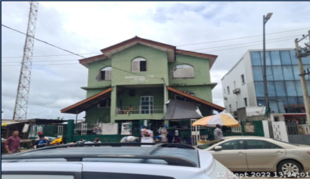
NAME: ANSAR-UD-DEEN SOCIETY OF NIGERIA ADDRESS: 18, LAGOS ROAD, AIYETORO, EPE DEFECTS: NIL