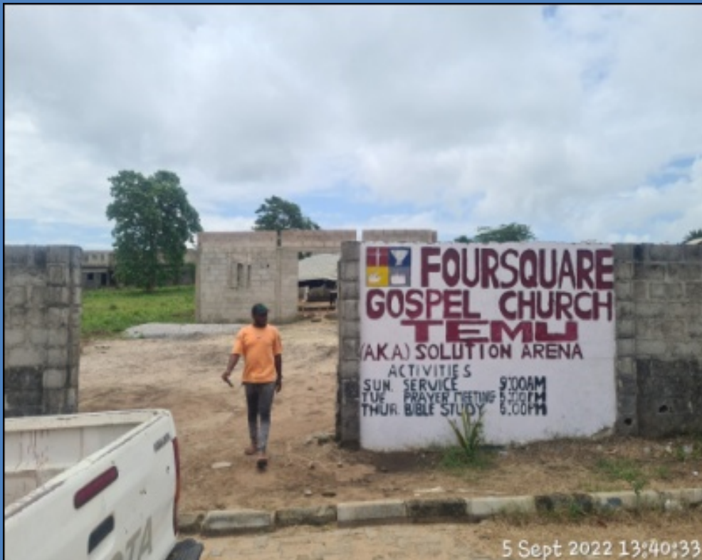
NAME: FOURSQUARE GOSPEL CHURCH ADDRESS: ALONG SHALDAG ROAD, OFF EPE ITOKIN ROAD, TEMU, EPE DEFECTS: NIL