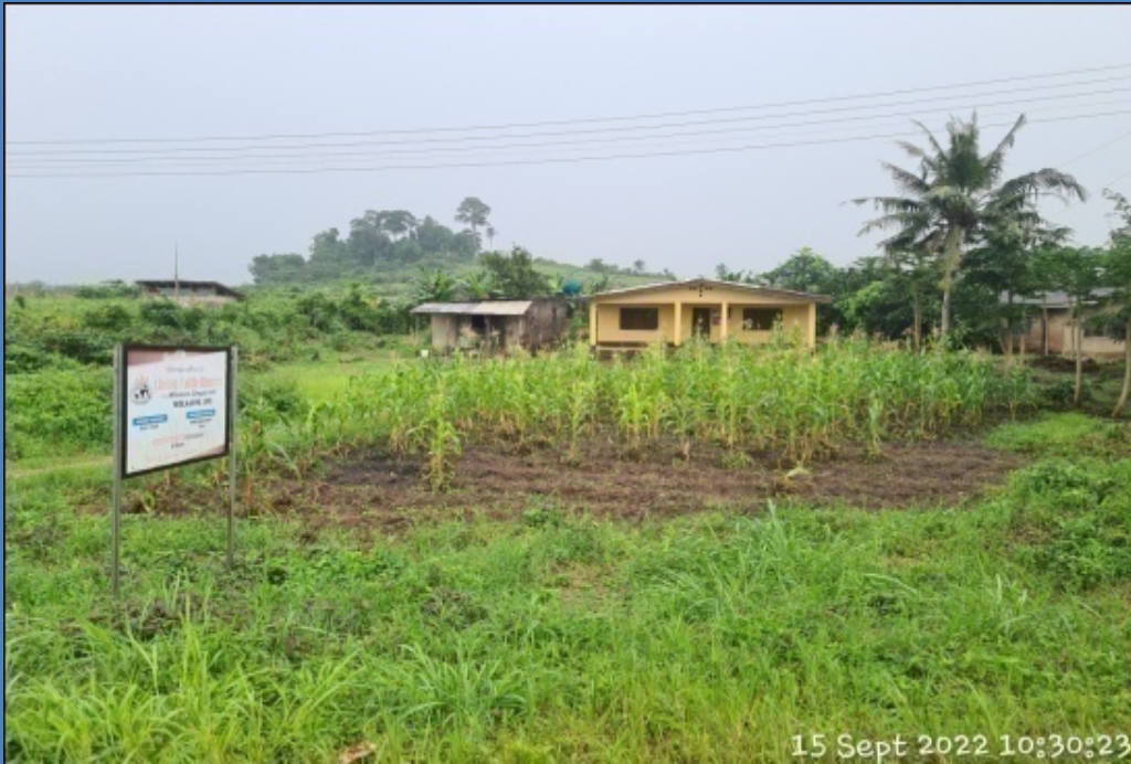
NAME: LIVING FAITH CHURCH (WINNERS CHAPEL) ADDRESS: EPE ITOKIN ROAD, MOLAJOYE, EPE DEFECTS: NIL