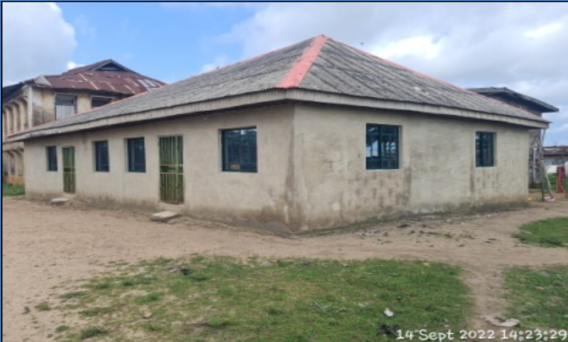
NAME: THE REDEEMED CHRISTAIN CHURCH OF GOD (STRONG TOWER AREA HEADQUARTERS) ADDRESS: POBO OBA STREET, EPE DEFECTS: DAMPNES NOTICED