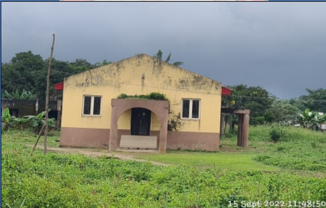
NAME: ST. JOSEPH'S CATHOLIC CHURCH ADDRESS: ITOKIN, IKOSI EJIRIN LCDA, EPE DEFECTS: DAMPNES & GROWTH OF ALGAE ON THE WALL