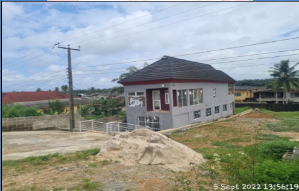
NAME: THE REDEEMED CHRISTAIN CHURCH OF GOD ADDRESS: ALONG LAGOS ROAD, ARISIKU JUNCTION, EPE DEFECTS: NIL