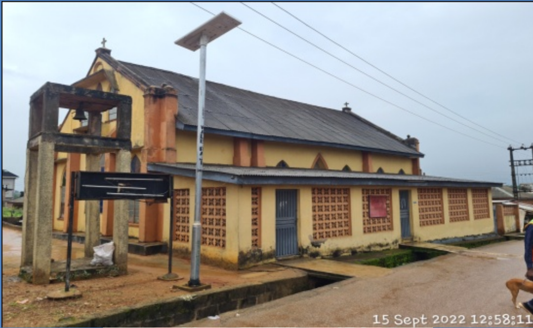
NAME: METHODIST CHURCH OF GOD ADDRESS: LATEEF JAKANDE ROAD, AGBOWA, EPE DEFECTS: DAMPNES NOTICED