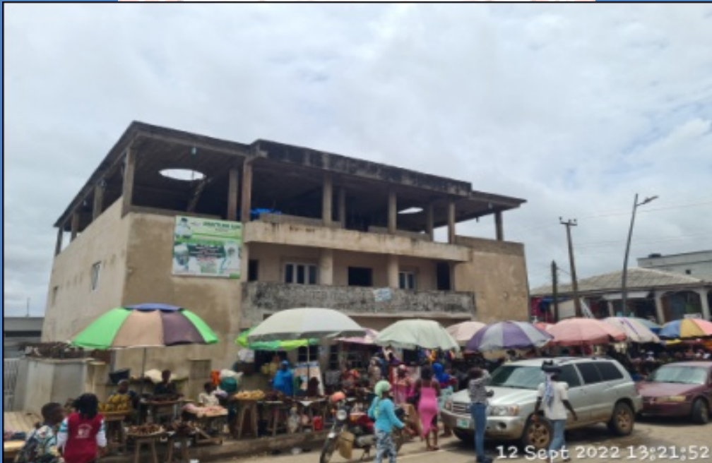
NAME: OLOHUNTOBI MUSLIM COMMUNITY CENTRAL MOSQUE ADDRESS: ALONG LAGOS ROAD, AIYETORO, EPE DEFECTS: NIL