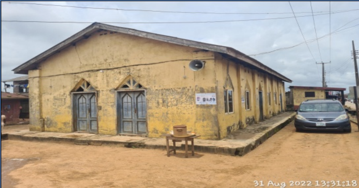
NAME: CHRIST CHURCH ADDRESS: ALONG CENTRAL MOSQUE ROAD, EYINDI, EPE DEFECTS: VISIBLE CRACK ALONG THE WALL WITH DAMPNESS