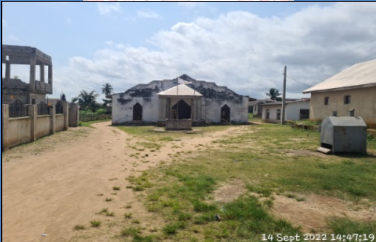
NAME: AGBALA SOLOMON CHURCH ADDRESS: AGBALA SOLOMON STREET, OFF LAGOS ROAD, EPE DEFECTS: NIL