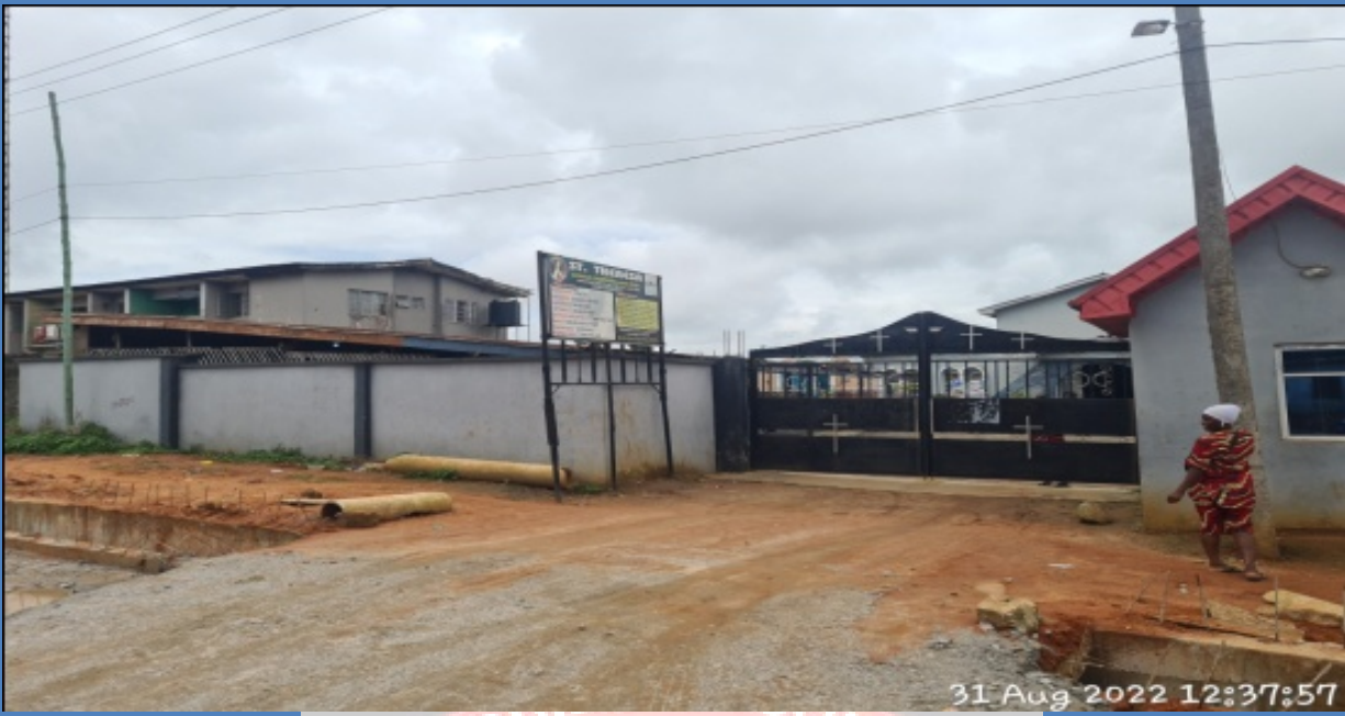
NAME: ST. THERESA CATHOLIC CHURCH ADDRESS: ALONG AWOLOWO ROAD, EPE DEFECTS: NIL