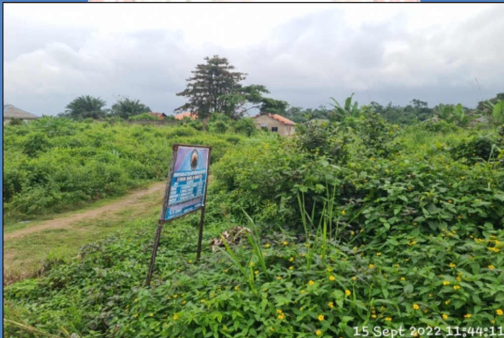
NAME: MOUNTAIN OF FIRE AND MIRACLES MINISTRIES (ITOKIN ZONAL HQ) ADDRESS: EPE ITOKIN ROAD, EPE DEFECTS: NIL