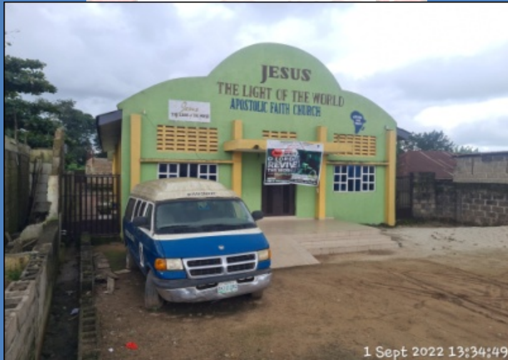
NAME: THE LIGHT OF WORLD APOSTOLIC FAITH CHURCH ADDRESS: EPE IJEBU ODE ROAD, MOJODA, EREDO, EPE DEFECTS: NIL