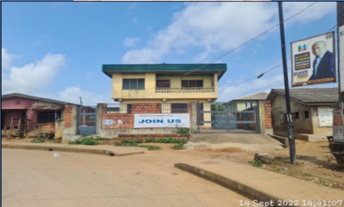
NAME: SAINT COMMUNITY CHURCH ADDRESS: KASALI OLUWO STREET, PAPA, EPE DEFECTS: NIL