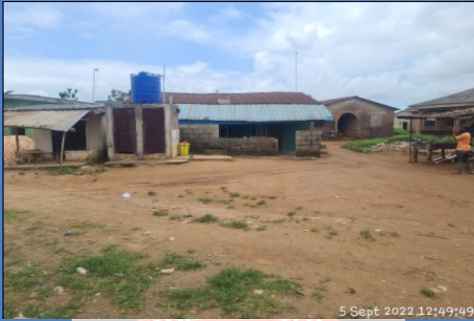
NAME: EXISTING MOSQUE ADDRESS: ALONG EPE ITOKIN ROAD, TEMU, EPE DEFECTS: NIL