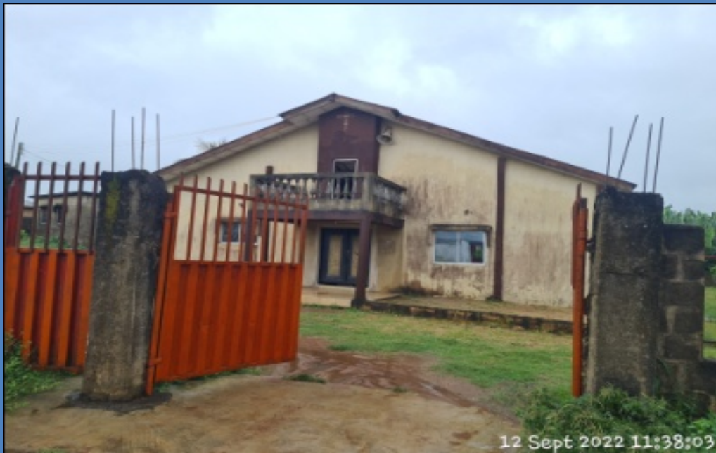
NAME: ANGLICAN CHURCH ADDRESS: ALONG CHRIST CHURCH OF C & S STREET, ODO EGIRI, EPE DEFECTS: DAMPNES NOTICED