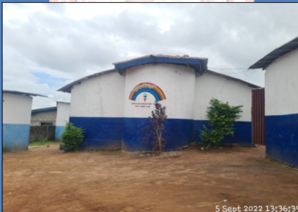
NAME: CELESTIAL CHURCH OF CHRIST, IRAPADA EMI REDEMPTION PARISH ADDRESS: ALONG EPE-ITOKIN ROAD, TEMU, EPE DEFECTS: DAMPNES