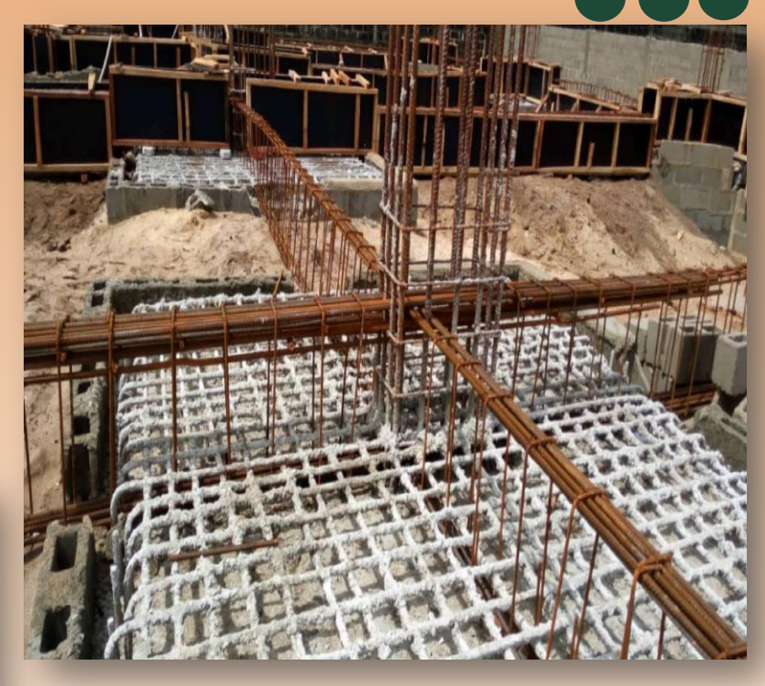
Ground Beams and Pile Caps Reinforcement placement

PROPERTY AT BLOCK 1, PLOT 5 ALONG ADEBAYO SHONUGA CRESCENT, LEKKI SCHEME 1