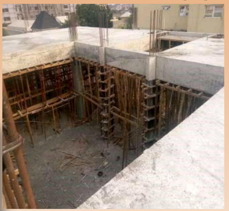
First floor concreting completed