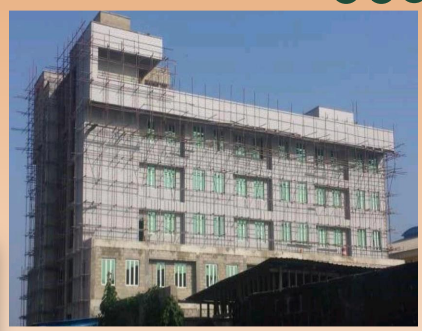
External finishes of the structure