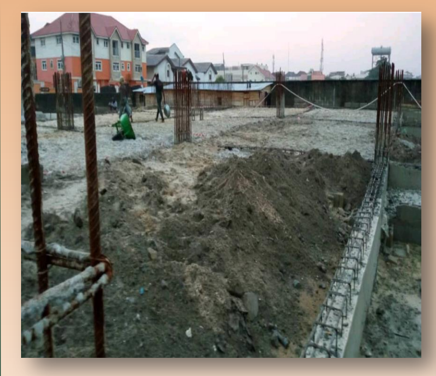
Ground Beams and Foundation Backfilling