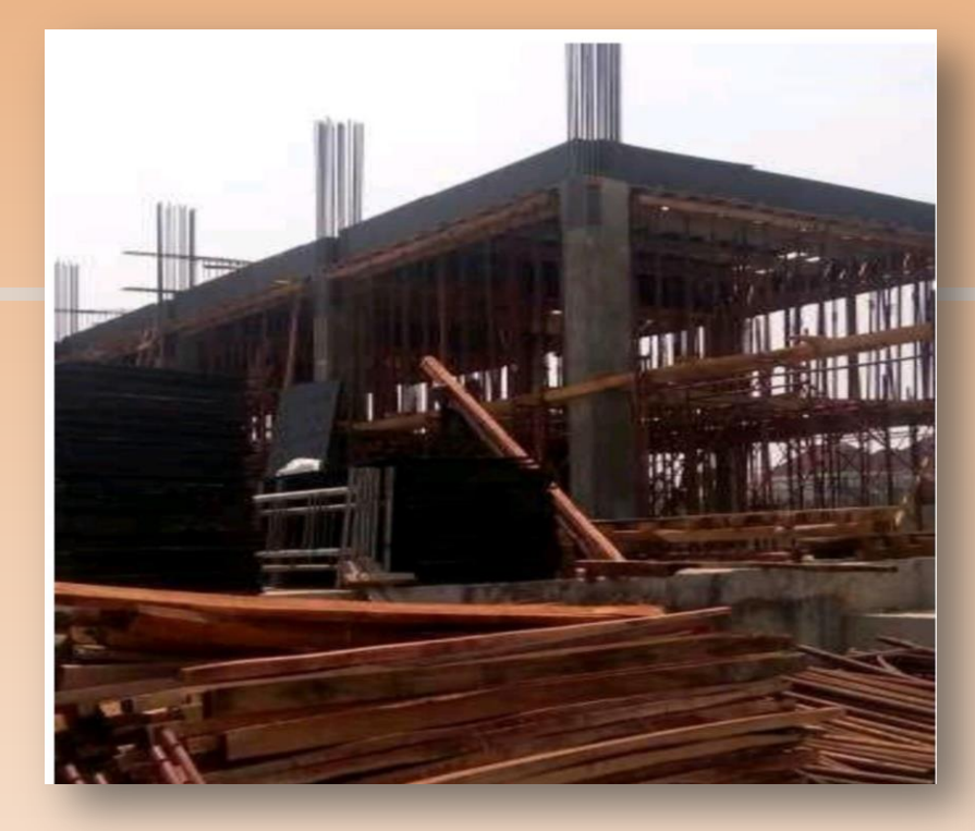
First floor formwork construction