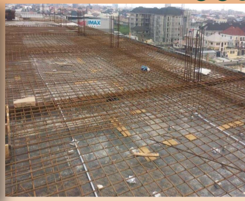
Construction of Upper floors Slabs