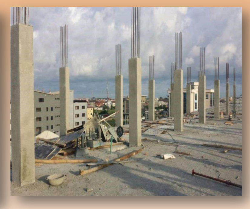
Construction of Upper floors Columns