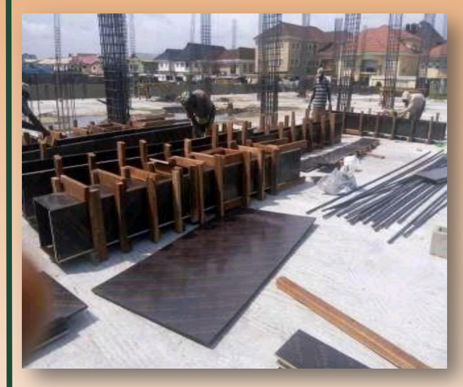
Placement of ground floor columns reinforcement