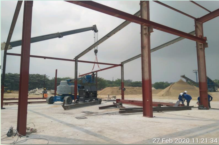
Erection of Steel Structures