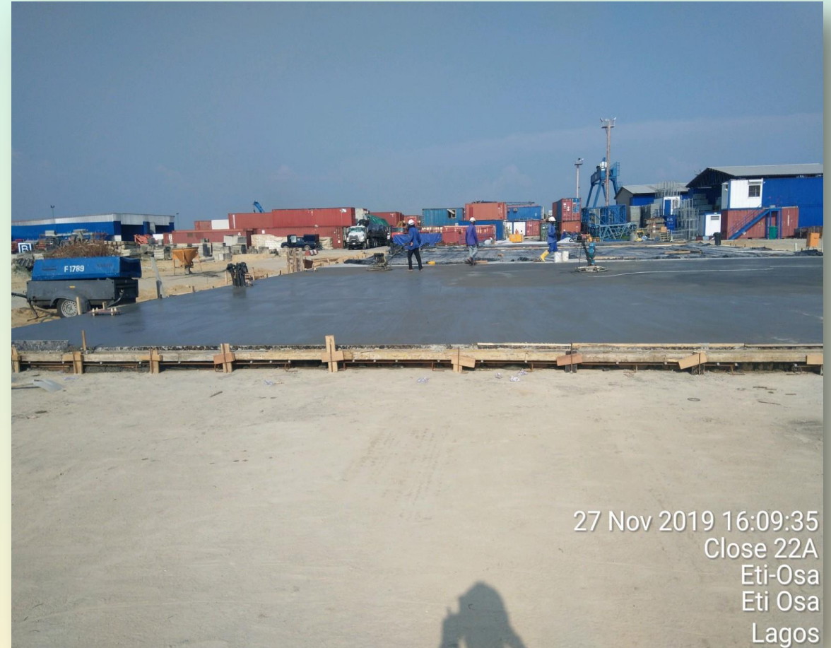
Concreting of Warehouse Pavement

COMMERCIAL DEVELOPMENT AT LOT 5-9, JULIUS BERGER LEKKI YARD, AJAH