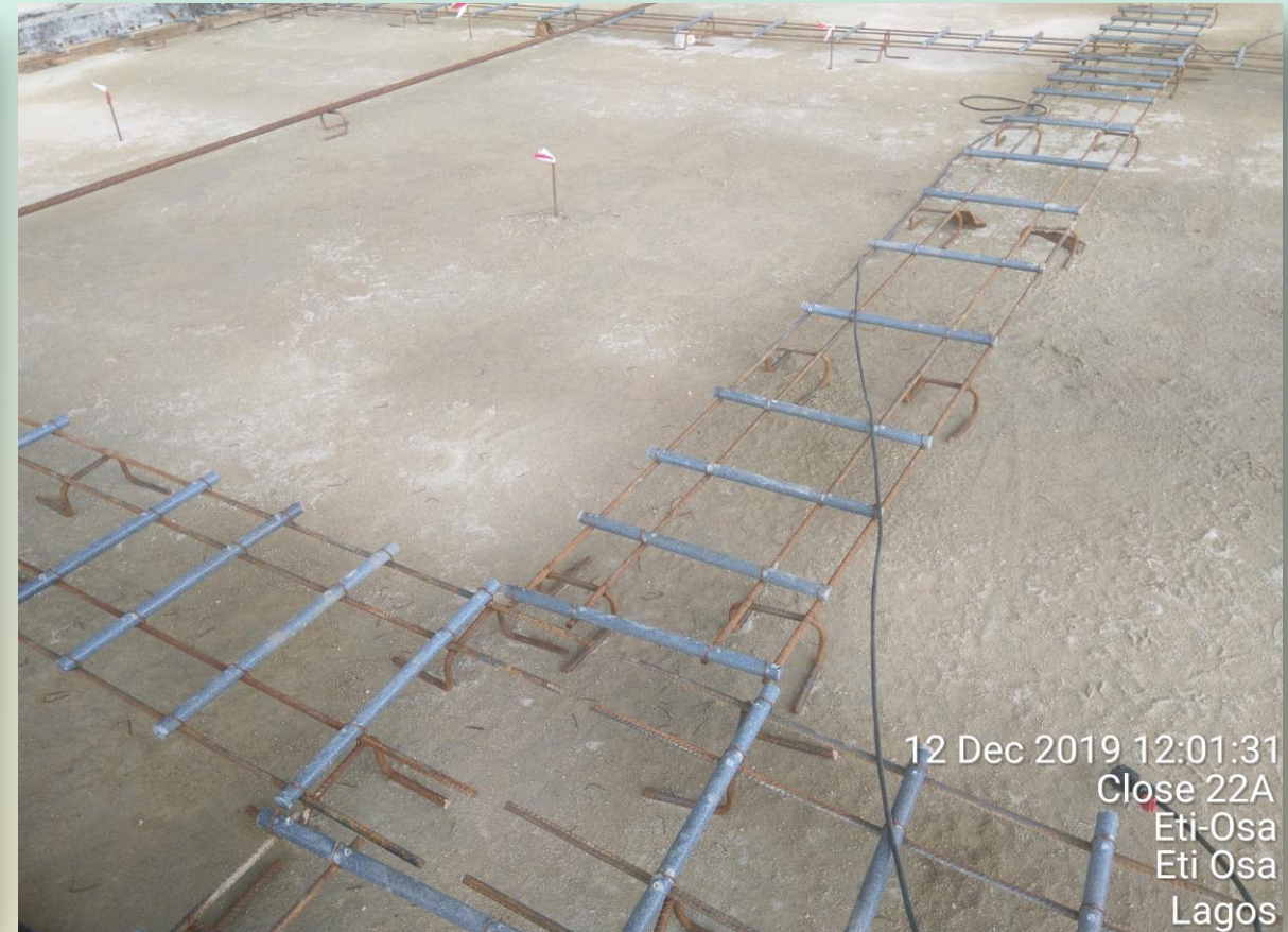
Installation of Dowel Bars for joints

COMMERCIAL DEVELOPMENT AT LOT 5-9, JULIUS BERGER LEKKI YARD, AJAH