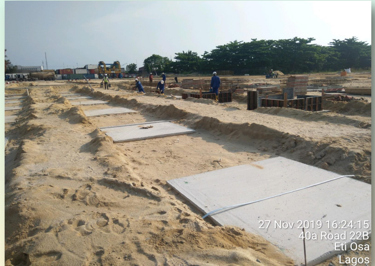
Foundation blinding for Stanchion Bases

COMMERCIAL DEVELOPMENT AT LOT 5-9, JULIUS BERGER LEKKI YARD, AJAH