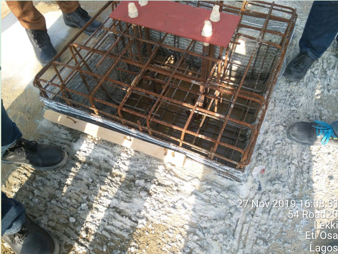
Installation of Stanchion base with Hold-Down Bolt